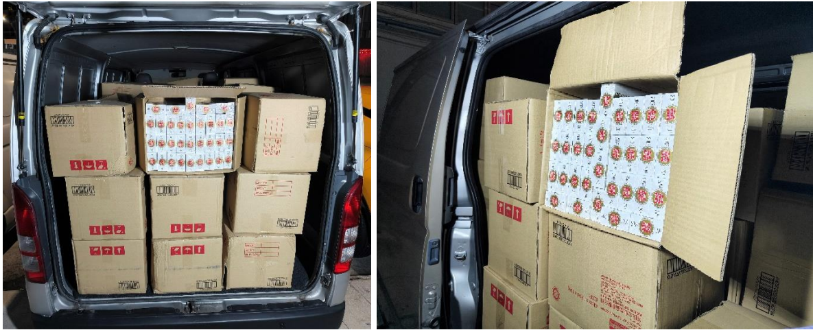
The duty-unpaid cigarettes found in the van at Marine Parade Central