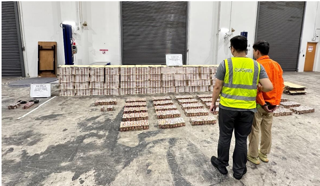
The man arrested at Tuas Link 3 and the duty-unpaid cigarettes seized