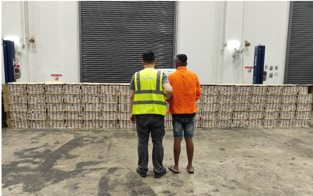
The man arrested at Marine Parade Central and the duty-unpaid cigarettes seized