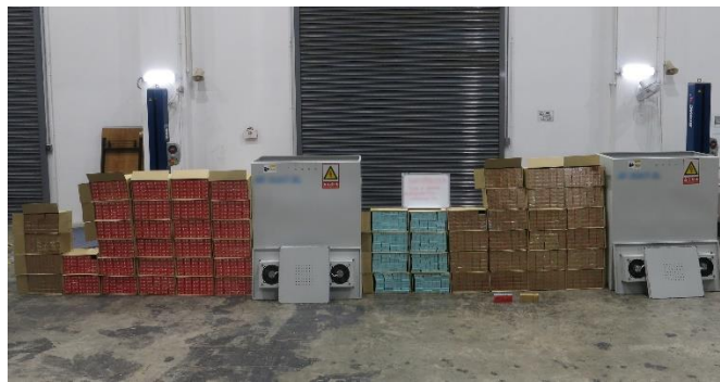
1,586 cartons and 18 packets of duty-unpaid cigarettes were seized in the operation.