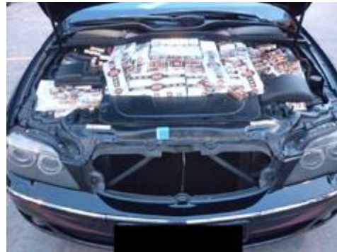
Duty-unpaid cigarettes hidden in the engine compartment of a BMW car.

In 2013, a total of 2,642 cartons and four packets of duty-unpaid cigarettes valued at more than S$250,000 were recovered from various compartments of luxury cars – including the seats, fuel tank, spare tyre and engine compartments – by enforcement officers. The duty and Goods and Services Tax (GST) evaded exceeded S$208,000.