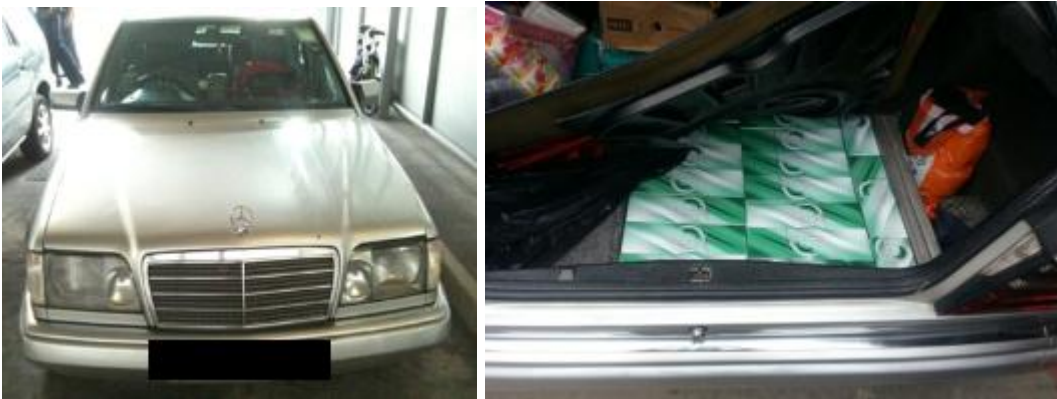
Duty-unpaid cigarettes hidden in the modified spare tyre compartment of a Mercedes-Benz car.

These offenders concealed the contraband cigarettes in modified compartments of their luxury cars. They assumed that luxury vehicles would less likely be checked by enforcement officers at the checkpoints.