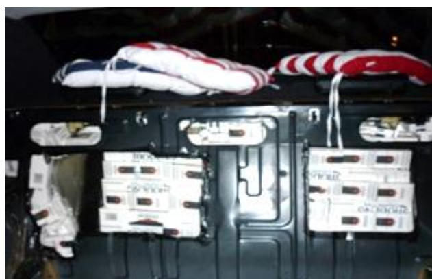
Duty-unpaid cigarettes hidden in the modified fuel tank of the Mercedes-Benz car.