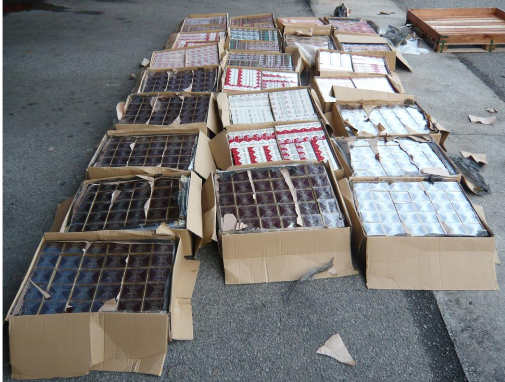
Singapore Customs seized 14,400 cartons of duty-unpaid cigarettes in a warehouse at Kallang Avenue on 20 May 2013.