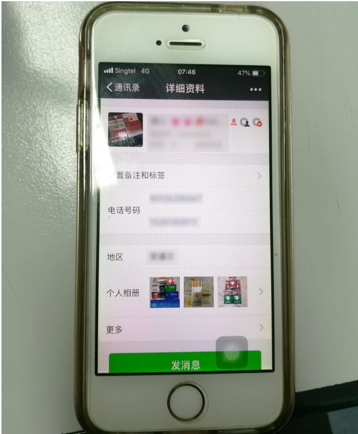
An advertisement put up by Zhu Yanqing on WeChat to source for potential buyers of duty-unpaid cigarettes.