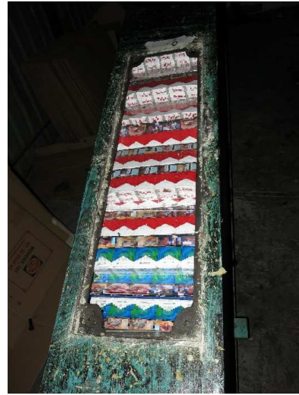
Duty-unpaid cigarettes concealed in the beams of the excavator arms.