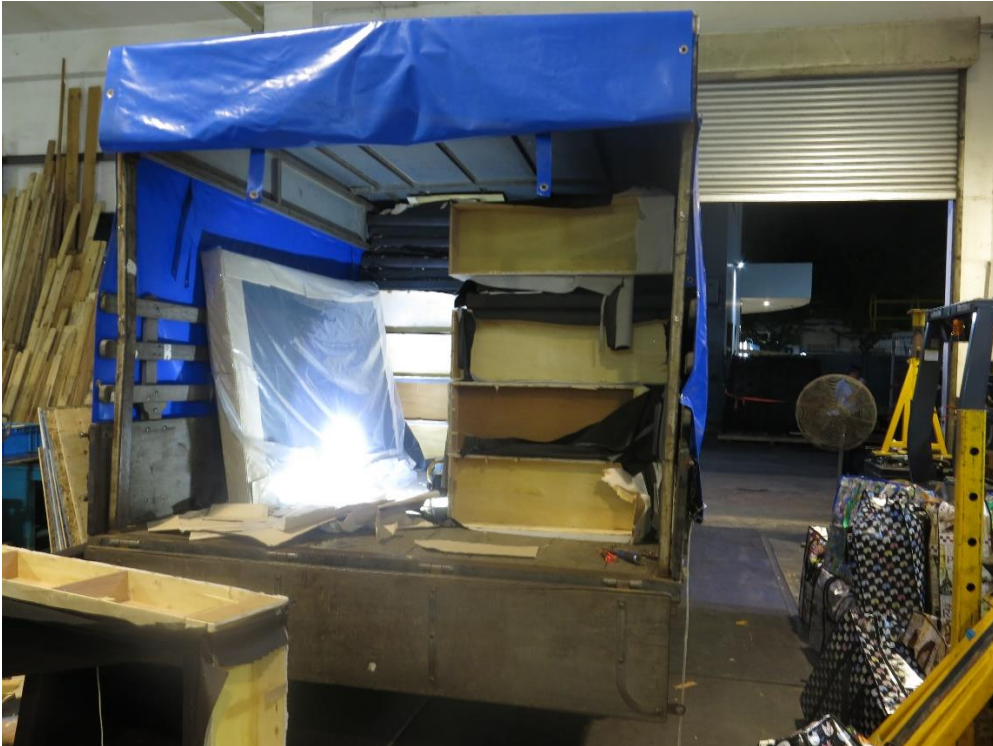
Bedframes concealed with duty-unpaid cigarettes found in the cargo compartment of a lorry.