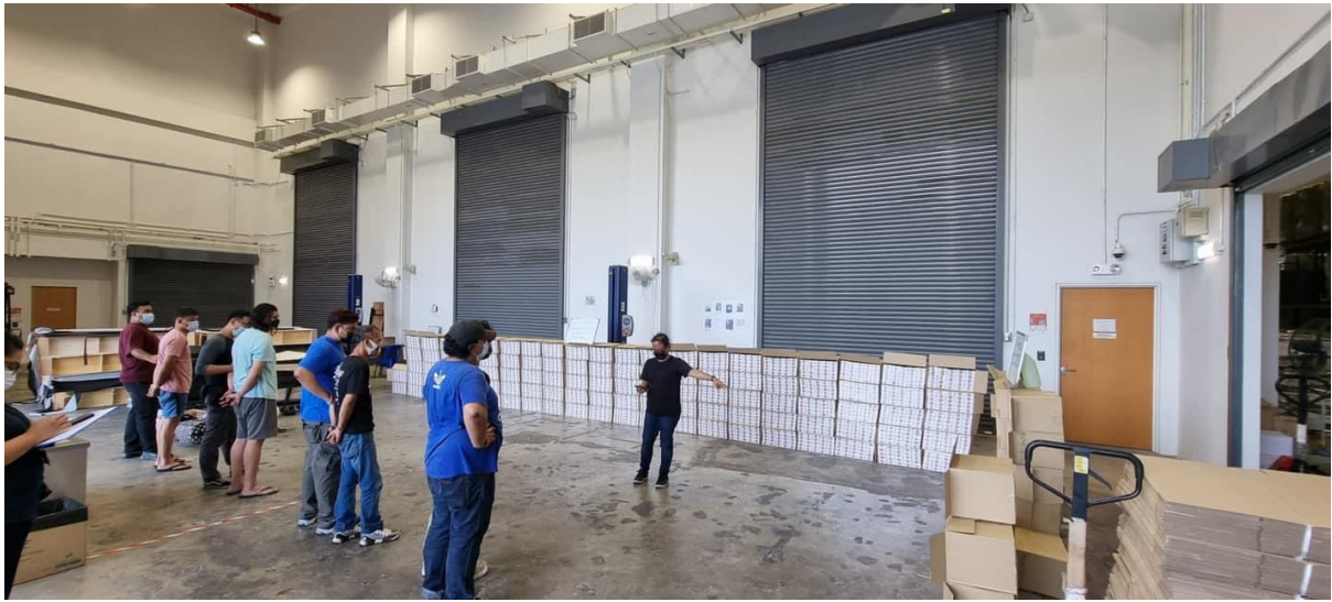
Four men arrested and 3,232 cartons of duty-unpaid cigarettes were seized during the operation.