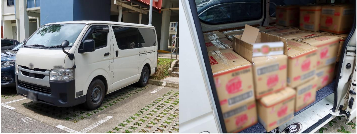
Duty-unpaid cigarettes found in the van at Bukit Batok Street 31