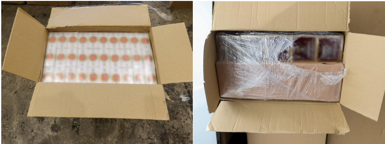
Duty-unpaid cigarettes found in the van at Jurong West Street 74