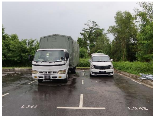
The lorry and car parked side-by-side at Tampines Road Heavy Vehicle Park.