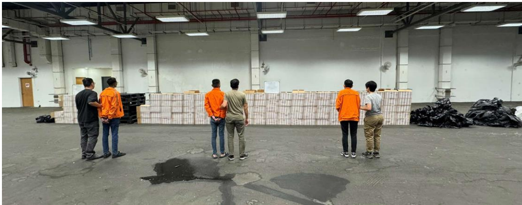
The two men and one woman arrested and the duty-unpaid cigarettes seized.