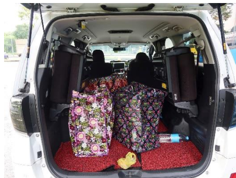
Duty-unpaid cigarettes found in the car at Marsiling Crescent Heavy Vehicle Park.