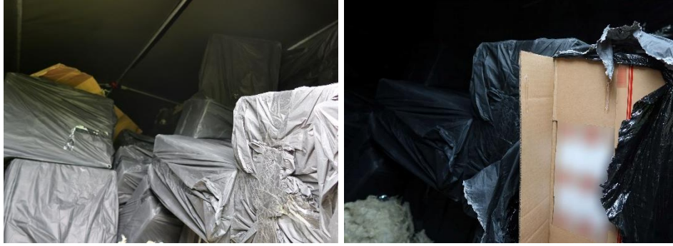
Duty-unpaid cigarettes found in the lorry at Tampines Road Heavy Vehicle Park.