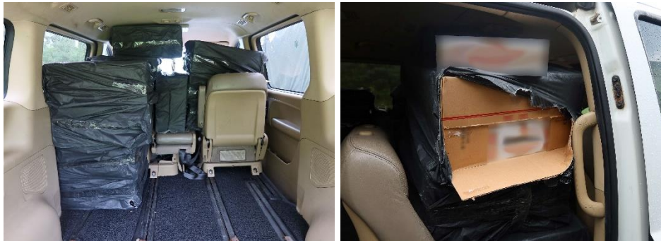
Duty-unpaid cigarettes found in the car at Tampines Road Heavy Vehicle Park.