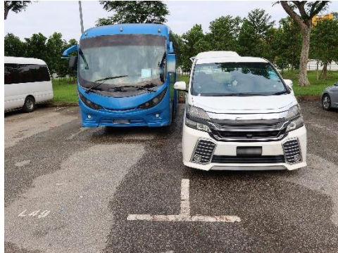
The bus and car parked side-by-side at Marsiling Crescent Heavy Vehicle Park.