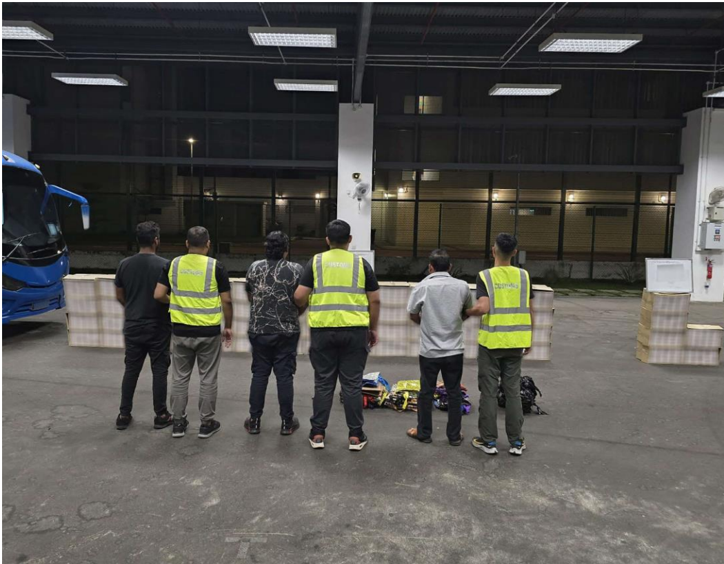
Three of the four men arrested and the duty-unpaid cigarettes seized.