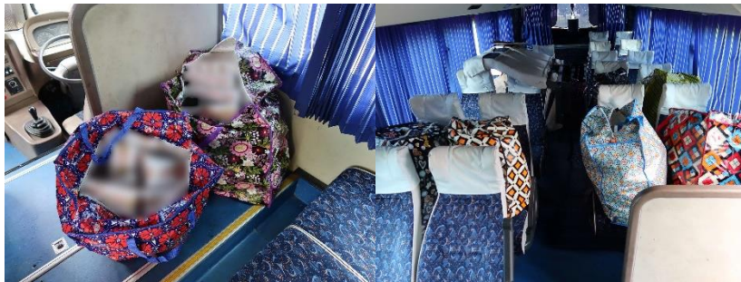
Duty-unpaid cigarettes found in the bus at Marsiling Crescent Heavy Vehicle Park.