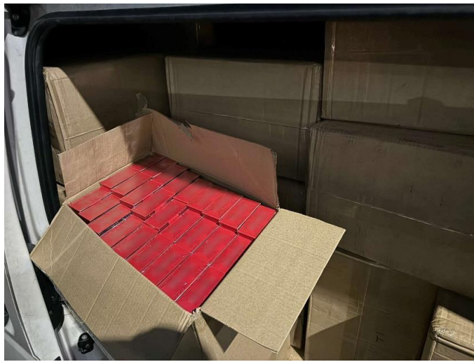
Duty-unpaid cigarettes found in the two vans.