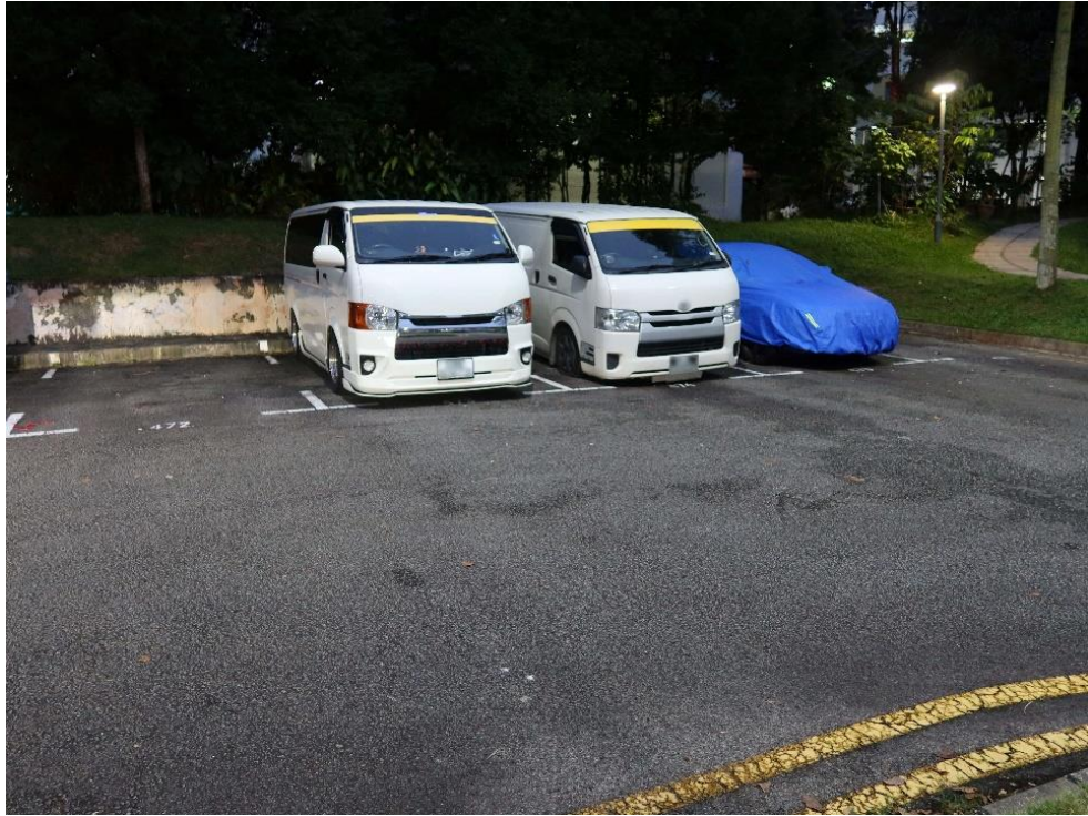
The two vans parked side-by-side.