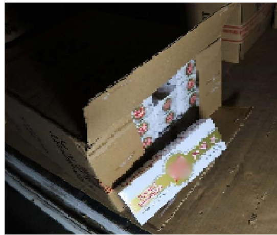
Duty-unpaid cigarettes found in the truck.