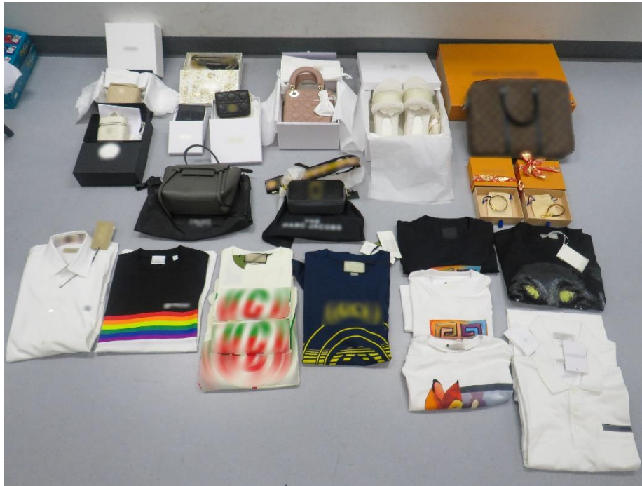
Branded goods seized from Wey.