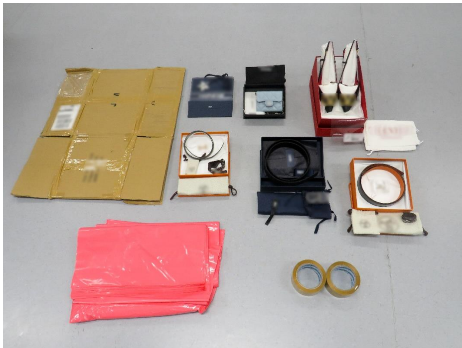
Branded goods seized from Song.