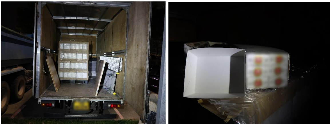
Duty-unpaid cigarettes found in the truck at Bendemeer Road.