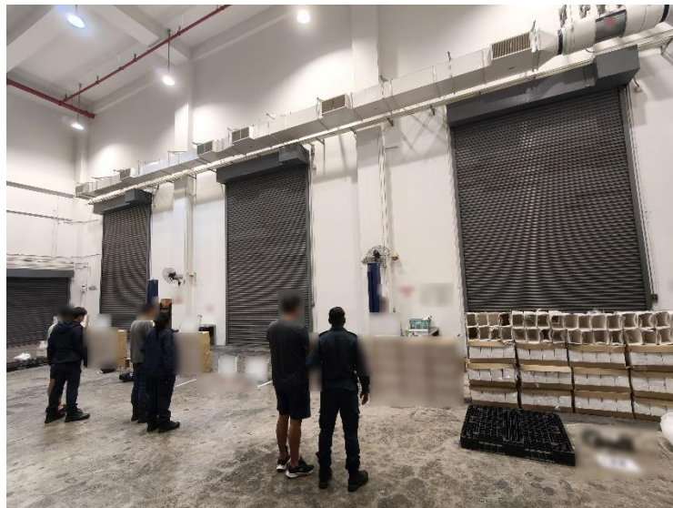
The three arrested men and the duty-unpaid cigarettes seized.