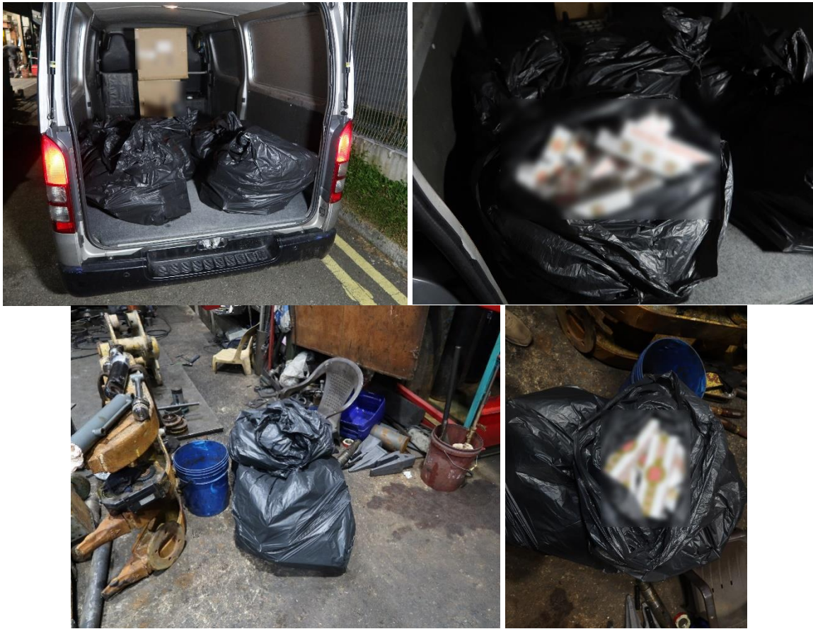
Duty-unpaid cigarettes found in the van and within the industrial unit at Joo Koon Circle.