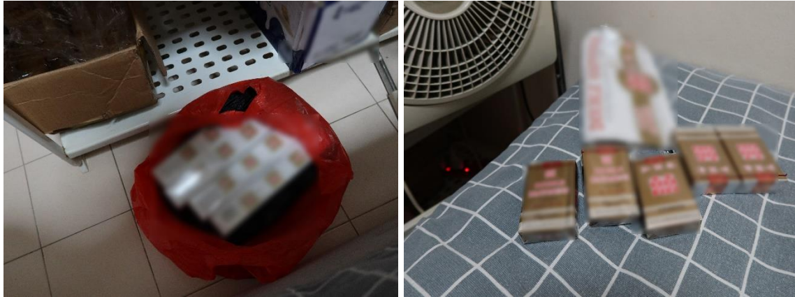
Duty-unpaid cigarettes found at the 41-year-old man's Moulmein Rise residence.