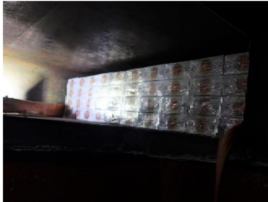
Duty-unpaid cigarettes found in bowser at Pasir Laba heavy vehicle carpark.