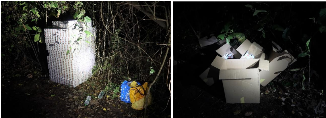
Duty-unpaid cigarettes found in forested area near Pasir Laba heavy vehicle carpark.