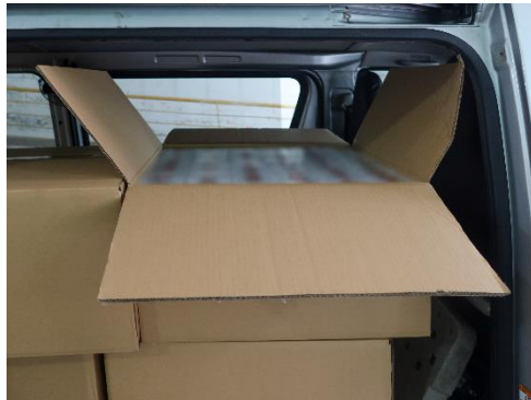
Duty-unpaid cigarettes found in the van.