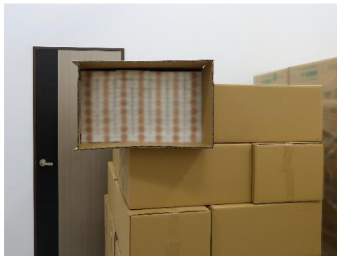
Duty-unpaid cigarettes found at the industrial unit at Pandan Loop.