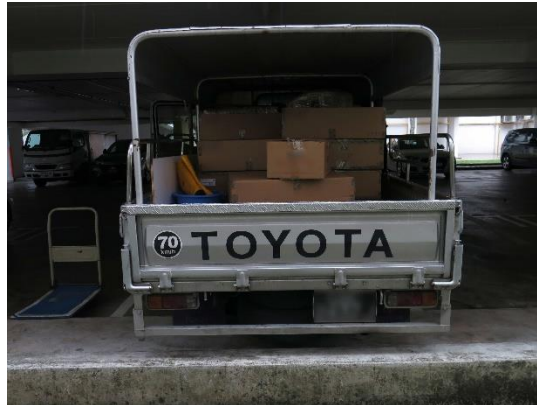
Lorry found to contain duty-unpaid cigarettes