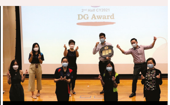
Long Service Award, Special Appreciation Award, Customs Staff Awards and WCO Certificate of Merit were presented to officers.