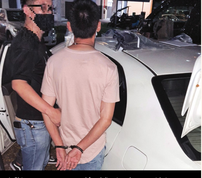
A Chinese man was arrested for delivering duty-unpaid cigarettes.

A 37-year-old Chinese national was sentenced on 13 January 2022 to three months' imprisonment for delivering duty-unpaid cigarettes transacted via a social messaging platform.