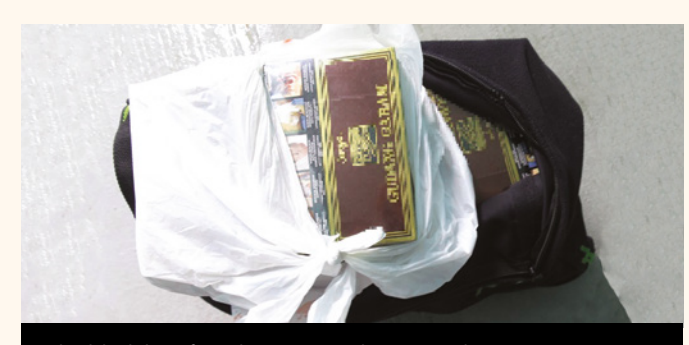
The black bag found to contain duty-unpaid cigarettes.

A 33-year-old Singaporean man was sentenced on 10 March 2021 to two months and one week's imprisonment for dealing with duty-unpaid cigarettes.