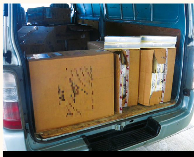
Duty-unpaid cigarettes were found in the van.

The Chinese national was the director of a company supplying sea stores to vessels and the Singaporean man was an employee in the same company. Investigations established that the two men had allegedly colluded to divert duty-unpaid cigarettes by ordering additional cigarettes on top of the genuine orders made by vessel captains. The genuine orders were delivered to the vessels while all the additional cigarettes were diverted inland for sale. A total of 3,520 cartons of duty-unpaid cigarettes were diverted inland between August and October 2021. The duty and GST evaded amounted to about $200,520 and $17,450 respectively. Court proceedings are ongoing against both men.