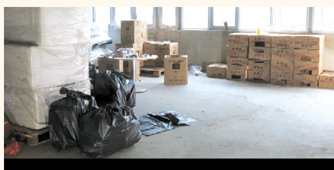
Duty-unpaid cigarettes were retrieved and repacked into black plastics bags in an industrial building.

During an operation near Kian Teck Road on 11 December 2021, Customs officers spotted three Bangladeshi men shifting four pallets of brown boxes from the unloading bay area of a building to a unit at level three of the same building. The three men were seen unwrapping the shrink wrap around the boxes inside the unit, and repacking the contents of the boxes