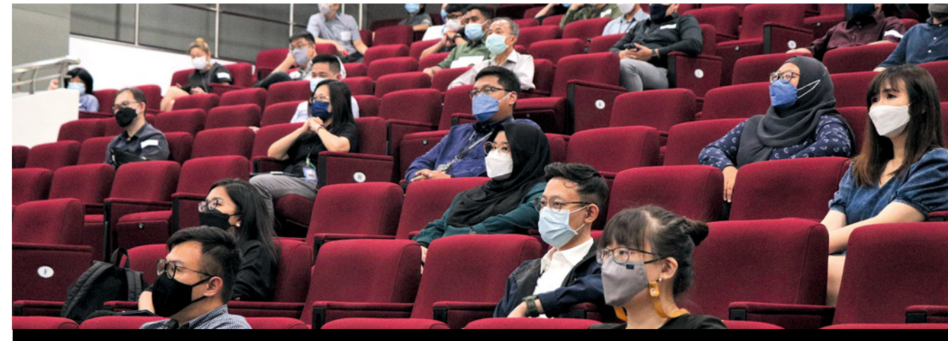
Attendees remained masked and seated at least 1-m apart.