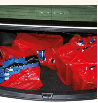
Duty-unpaid cigarettes found inside the vehicle.