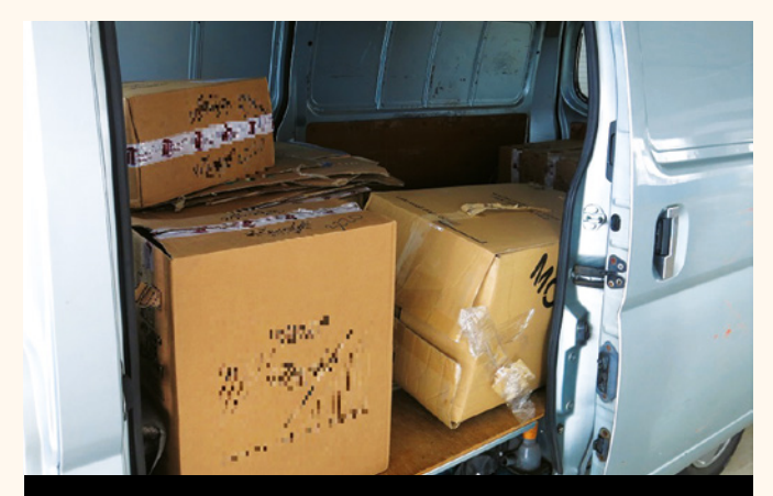
Duty-unpaid cigarettes were found in the van.