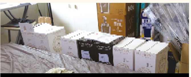
Duty-unpaid liquor were found at the man's residence.