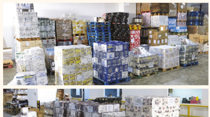
Duty-unpaid liquor found at the warehouse.

More than 120,000 bottles of duty-unpaid liquor were seized, and investigations are ongoing.