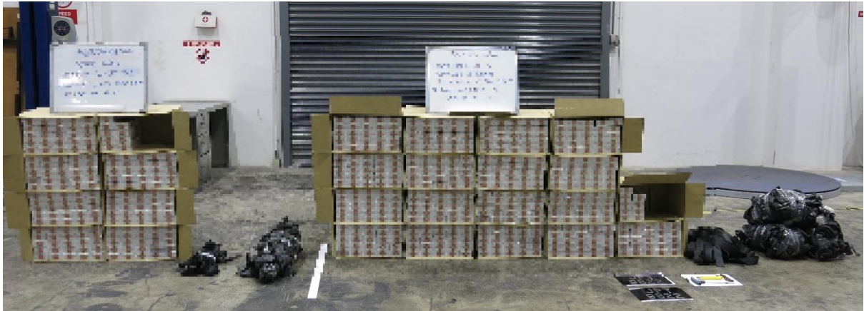
A total of 618 cartons of duty-unpaid cigarettes were seized.