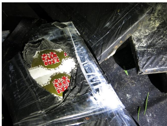
Duty-unpaid cigarettes found in the van.