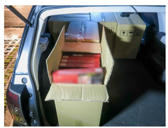
Duty-unpaid cigarettes found in the car.