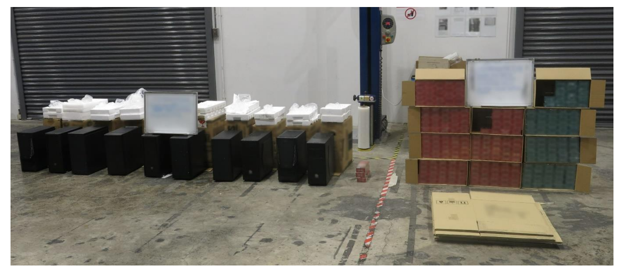
261 cartons of duty-unpaid cigarettes and 10 computer casings seized in the operation.