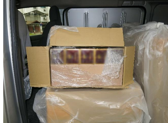
Duty-unpaid cigarettes found in the van.