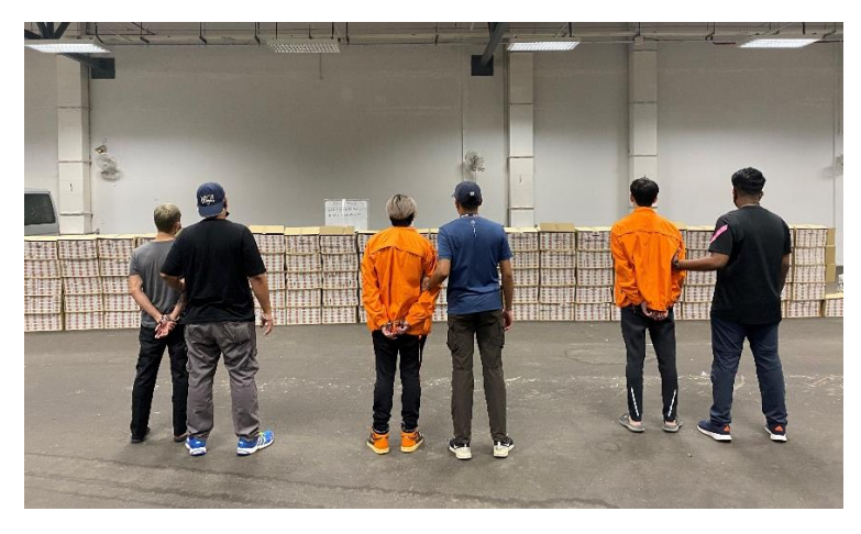
The three men arrested and duty-unpaid cigarettes seized.

Mattresses allegedly used as cover loads to conceal the duty-unpaid cigarettes.