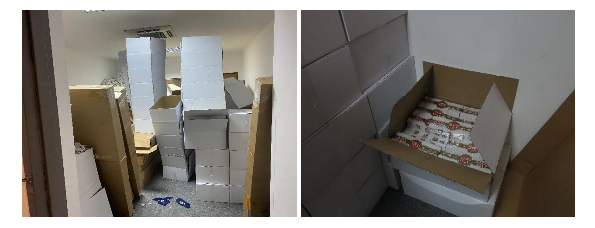
Duty-unpaid cigarettes found in the industrial unit.