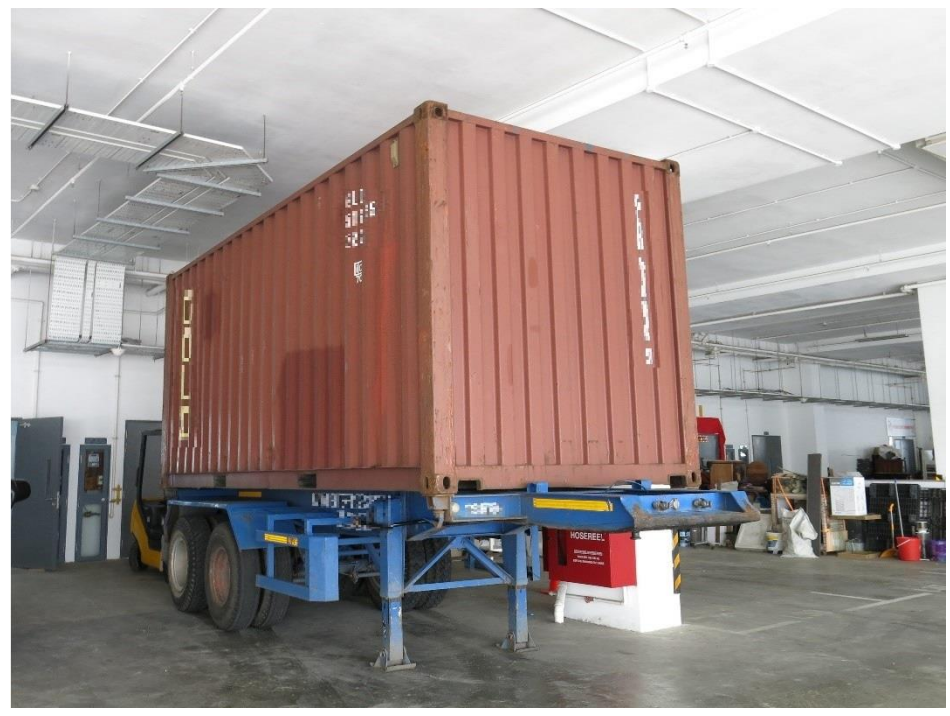
On 23 March 2018, Singapore Customs officers conducted a check on a 20-foot container at an industrial building in Sunview Road.