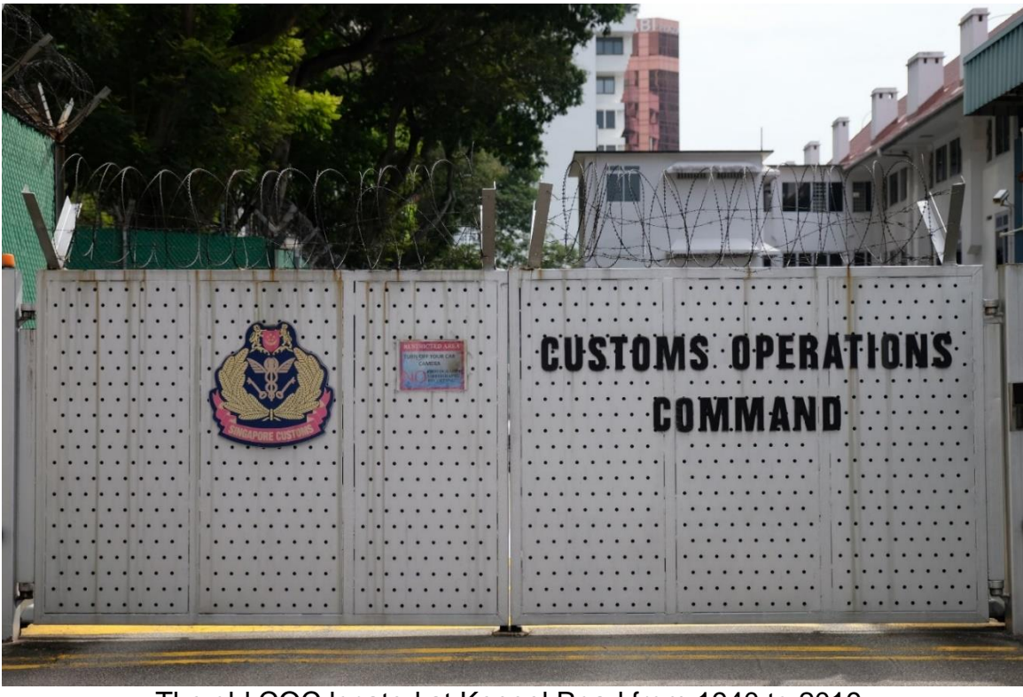
The old COC located at Keppel Road from 1940 to 2019.