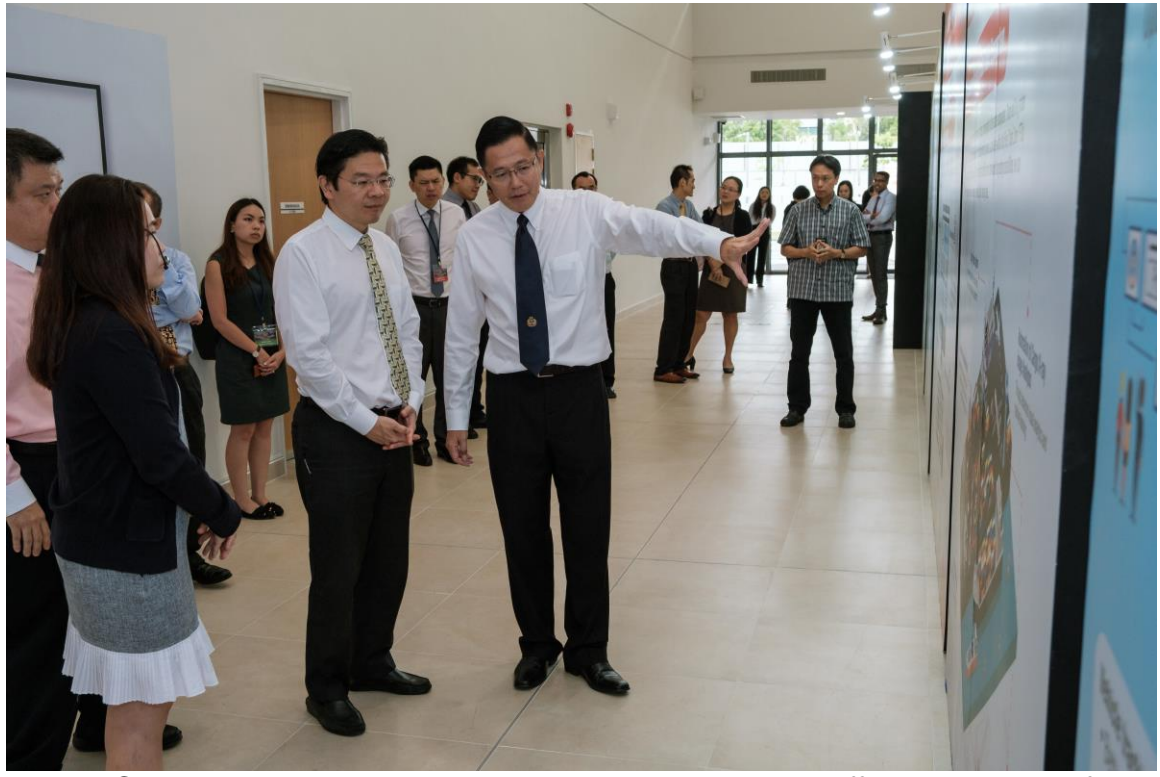
Mr Ho Chee Pong showing Minister Lawrence Wong the different aspects of the Customs Transformation Gallery.