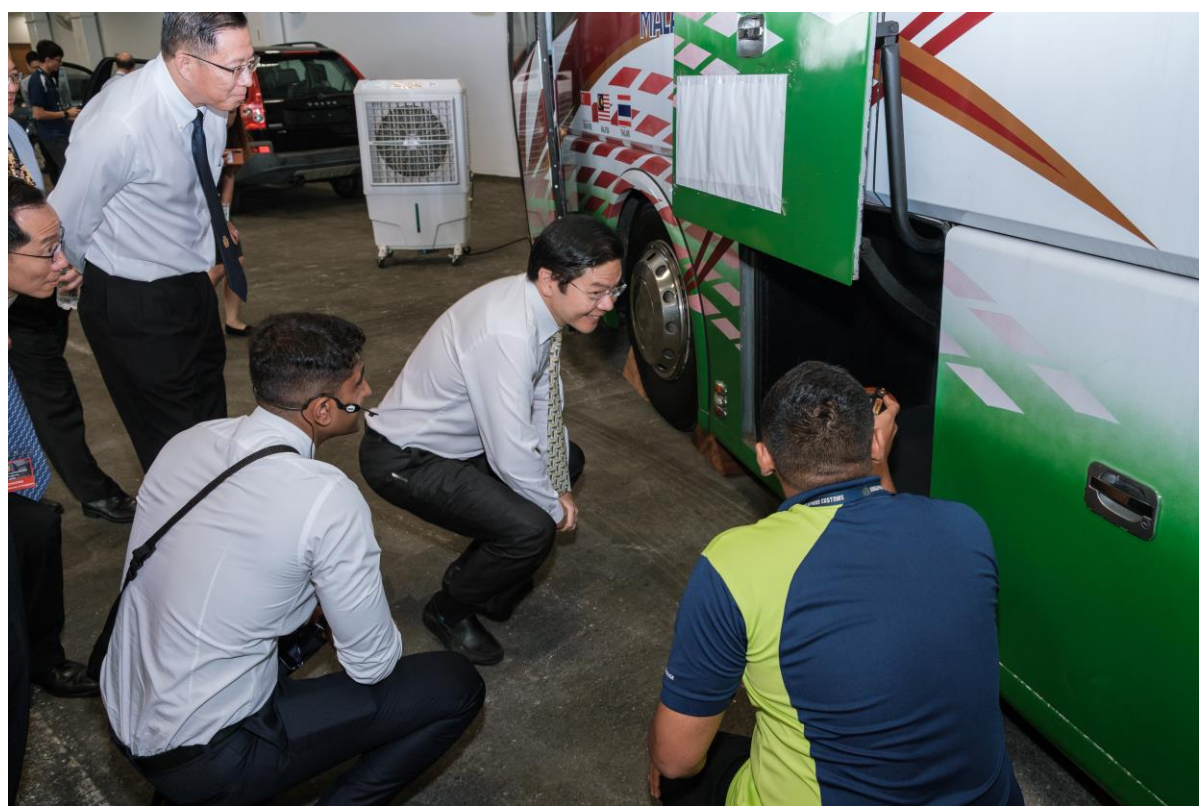
Minister Lawrence Wong being shown by Customs staff how contraband cigarettes could be hidden in various compartments of a bus.