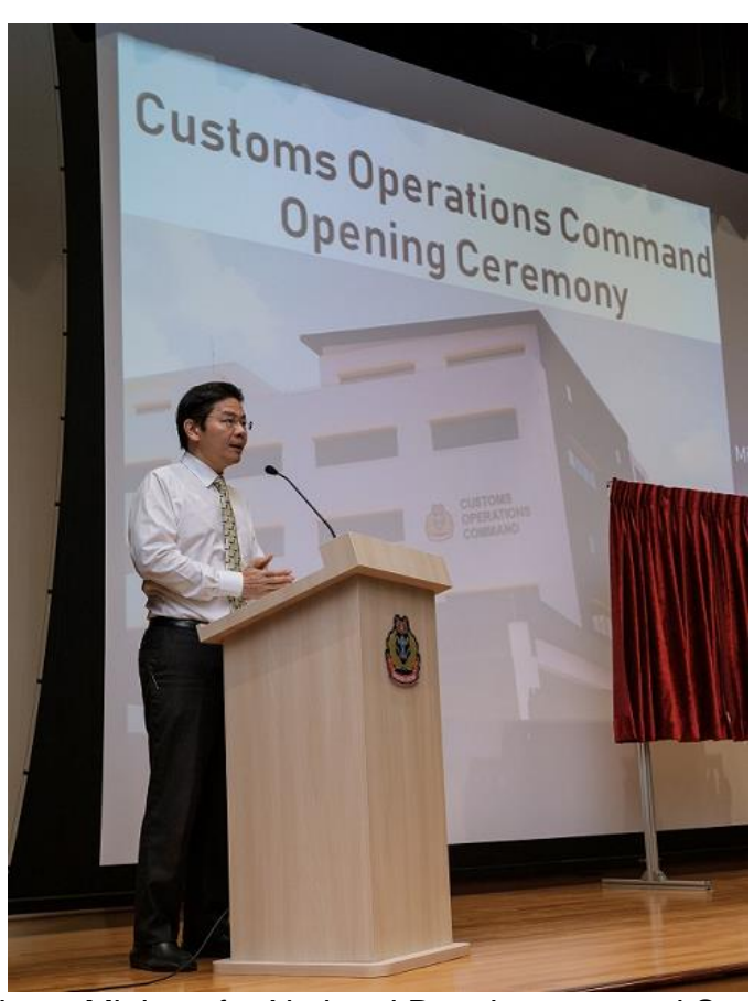
Mr Lawrence Wong, Minister for National Development and Second Minister for Finance, delivering his speech at the opening of the new COC.