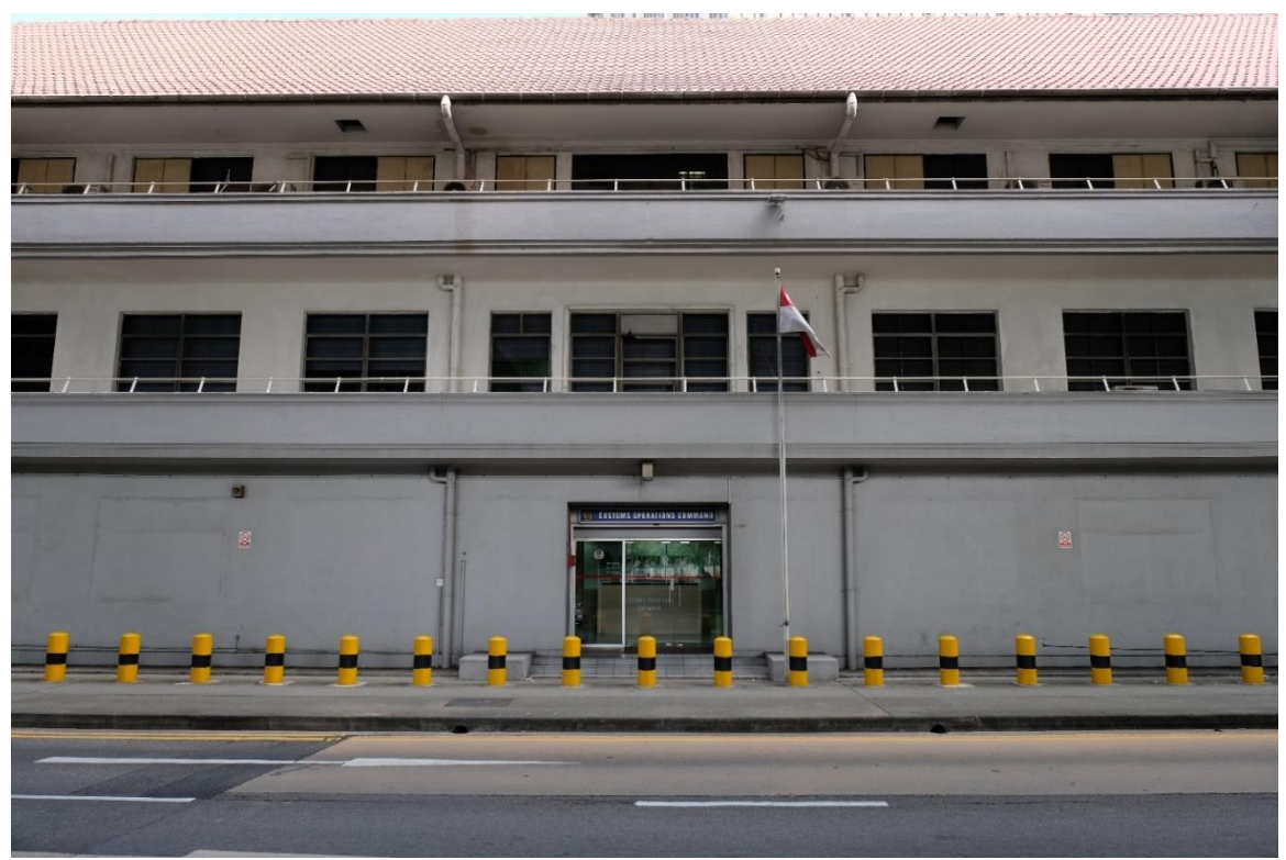
The old COC located at Keppel Road from 1940 to 2019