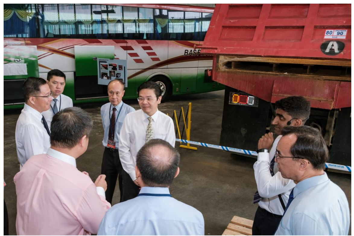
Minister Lawrence Wong chatting with Customs staff and guests.