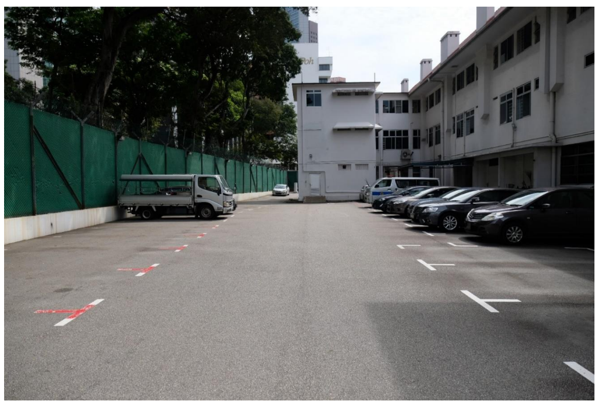
Carpark of the old Customs Operations Command located at Keppel Road.