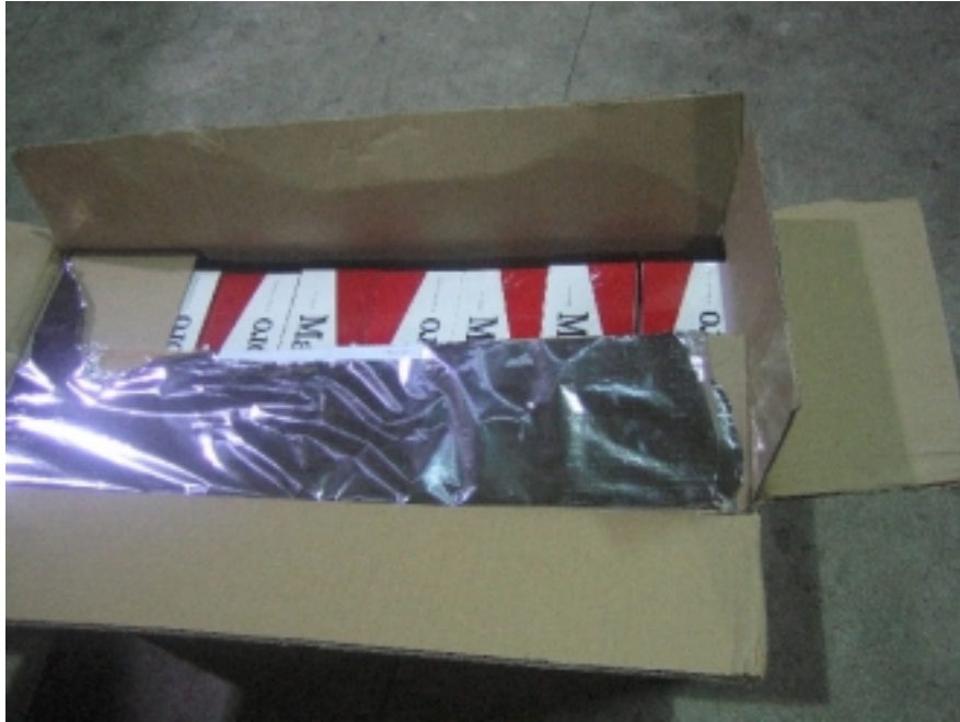
A foiled smuggling attempt by ICA and SC

7 After the carton boxes were repacked and loaded onto two other Singapore-registered trucks, Customs officers moved in and arrested four Singaporean subjects, 3 males and 1 female, aged between 24 and 38. In the course of arrest, a 30 year-old Chinese male subject tried to flee but was swiftly apprehended by an ICA officer. The smugglers had attempted to evade duty and GST payable of $141,926 and $12,842 respectively.