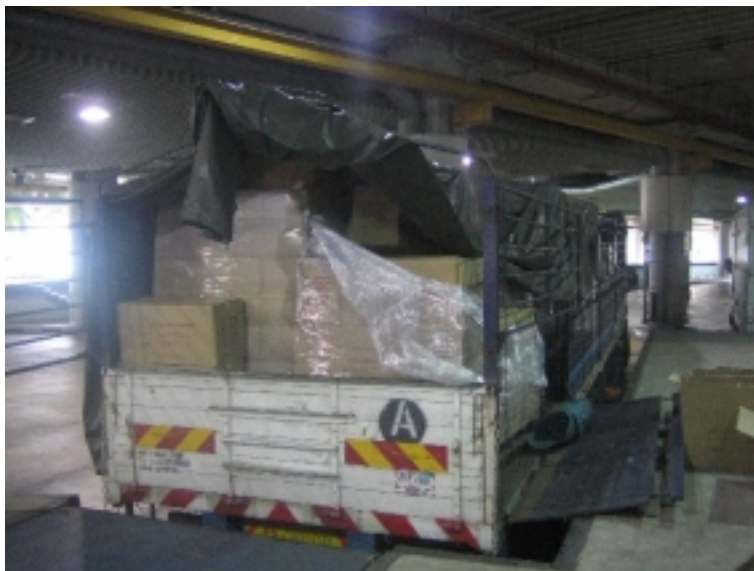
The seemingly innocuous consignment

2 On 24 November 2008 at about 0745 hrs, an inbound Malaysian-registered truck declared to be conveying disposable food containers and wrapping films pulled into Tuas Checkpoint and was directed for radiographic scanning. The officers found the scanned image to be inconsistent with the declared consignment.