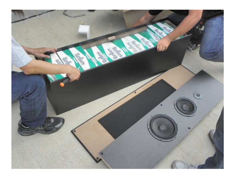
Contraband cigarettes uncovered in the surround speakers