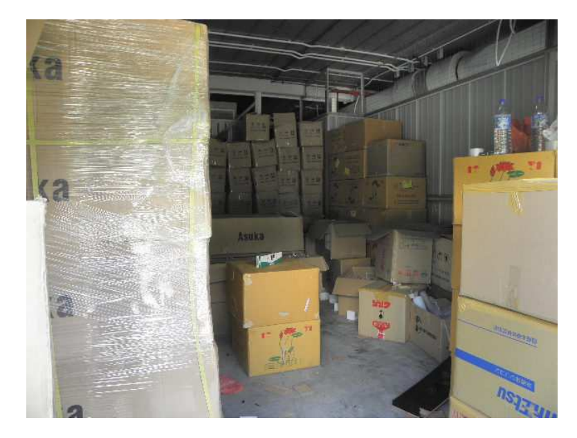
Cardboard boxes were found lying around in the 200 square feet warehouse unit

Customs officers kept watch outside the warehouse unit