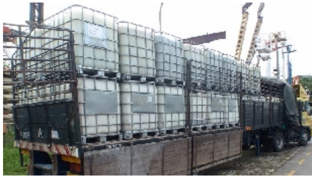
Trailer declared to be containing 'rubber latex'

3 According to the trade permit, the consignment declared to be 38 drums of rubber latex, were marked as corrosive and flammable. For safety reasons, officers had to exercise caution during the preliminary inspection. They used a wooden pole as a dip stick and found that the drums were only one-third full. As the content of the drums were thought to be toxic, officers arranged for the mixture to be tested and had the trailer towed to the Singapore Customs Operation Command, pending results of the laboratory tests.