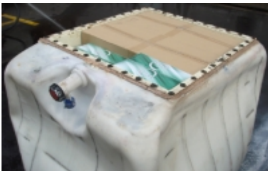
Contraband cigarettes uncovered

4 The tests revealed that the drums contained only contaminated water with no trace of toxic or corrosive chemicals in it. They immediately sprang into action, eager to uncover what lay in the drums. Before they could proceed, they had another challenge ahead. Each drum weighed a hefty one tonne! A forklift had to be used to unload the drums carefully one by one. Once the container was inverted with the help of the mechanical arm and the metal casing securing the drums removed, contraband cigarettes were sighted. A total of 4,850 cartons of contraband cigarettes were uncovered. The potential duty and GST involved amounted to $341,440 and $30,850 respectively.