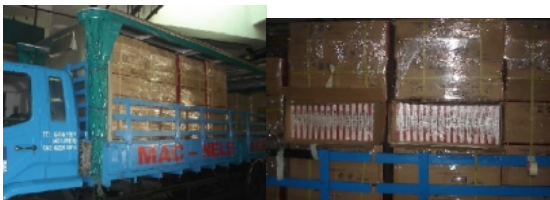
Contraband cigarettes uncovered in boxes of “ventilators”

6 A total of 5,996 cartons of contraband cigarettes were uncovered. The potential duty and GST involved amounted to $422,120 and $38,200 respectively. The driver, as well as the contraband cigarettes and the vehicle were handed over to SC for investigation