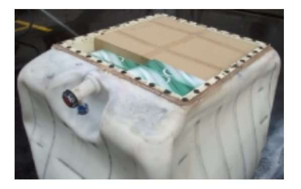
Contraband cigarettes uncovered

The tests revealed that the drums contained only contaminated water with no trace of toxic or corrosive chemicals in it. They immediately sprang into action, eager to uncover what lay in the drums. Before they could proceed, they had another challenge ahead. Each drum weighed a hefty one tonne! A forklift had to be used to unload the drums carefully one by one. Once the container was inverted with the help of the mechanical arm and the metal casing securing the drums removed, contraband cigarettes were sighted. A total of 4,850 cartons of contraband cigarettes were uncovered. The potential duty and GST involved amounted to $341,440 and $30,850 respectively.