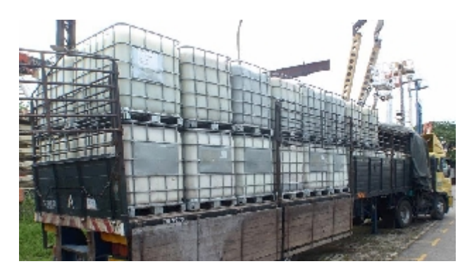
Trailer declared to be containing 'rubber latex'

3 According to the trade permit, the consignment declared to be 38 drums of rubber latex, were marked as corrosive and flammable. For safety reasons, officers had to exercise caution during the preliminary inspection. They used a wooden pole as a dip stick and found that the drums were only one-third full. As the content of the drums were thought to be toxic, officers arranged for the mixture to be tested and had the trailer towed to the Singapore Customs Operation Command, pending results of the laboratory tests.