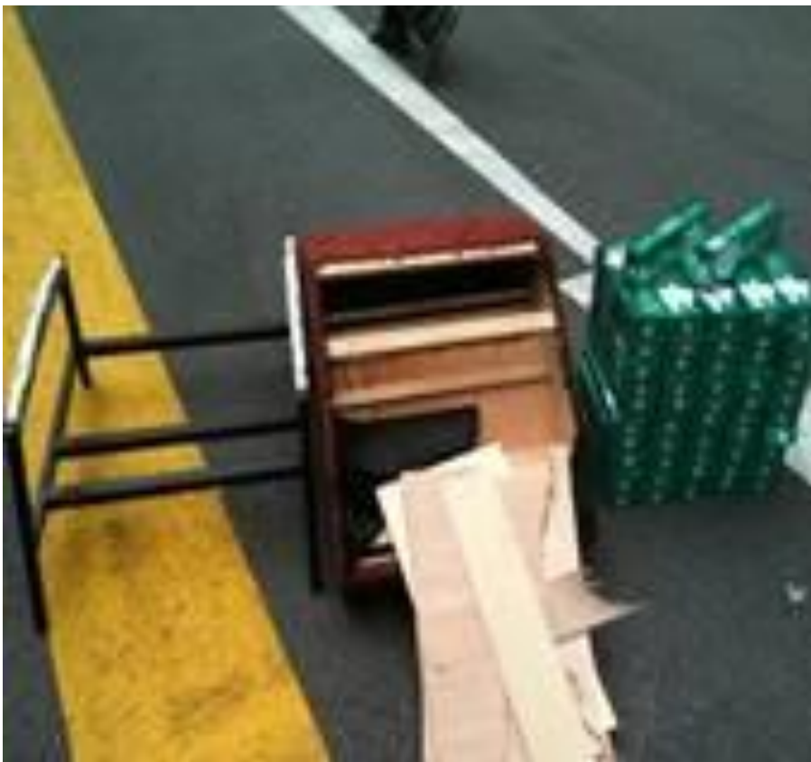
The base of the seats were hollowed out to contain contraband cigarettes