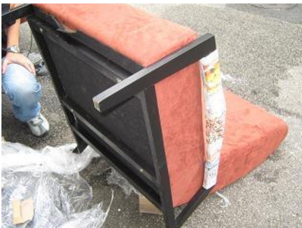
Each sofa was wrapped in plastic sheet to avoid detection by officers