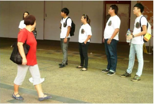
Burn mark T-shirts worn by the anti-illegal cigarettes "ambassadors" attracting public attention during the pre-launch phase at Raffles Place (left) and Woodlands (right)