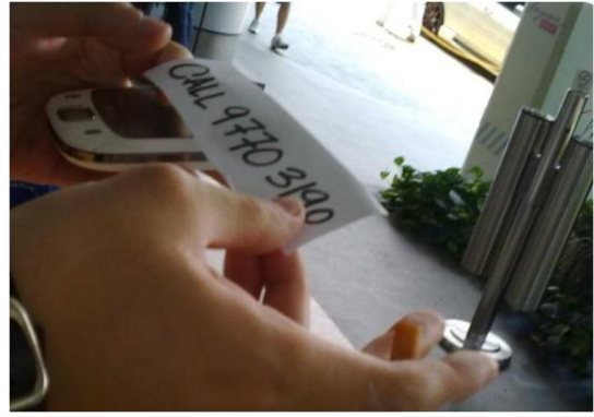
Slips containing the call-line number being distributed at various locations (left) Curious member of the public dialing the call-line listening to the public education message (right)