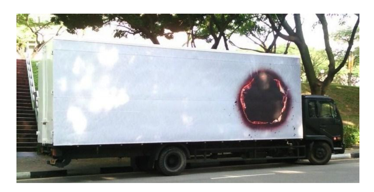
Truck with the burn mark roving island-wide since end-August 2010 as one of the pre-campaign launch initiatives

Furthermore, to reinforce the logo identification of the burn mark carried by the roving truck, anti-illegal cigarettes "ambassadors" hit the streets wearing the iconic burn mark T-shirts on 20 September 2010. In addition, during the weekend from 24 to 26 September 2010 leading to the launch of the campaign, slips containing the public advisory call-line number 9770 3190 were distributed to smokers and members of the public at several locations such as Eunos, Woodlands, Chinatown, Little India, Raffles Place and Orchard Road, urging them to call and learn about the consequences of dealing with illegal cigarettes.