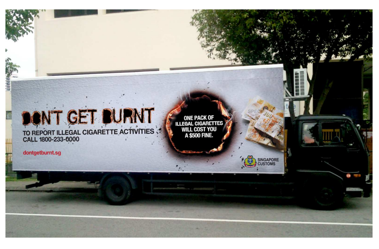
Then this... (since 28 September 2010)