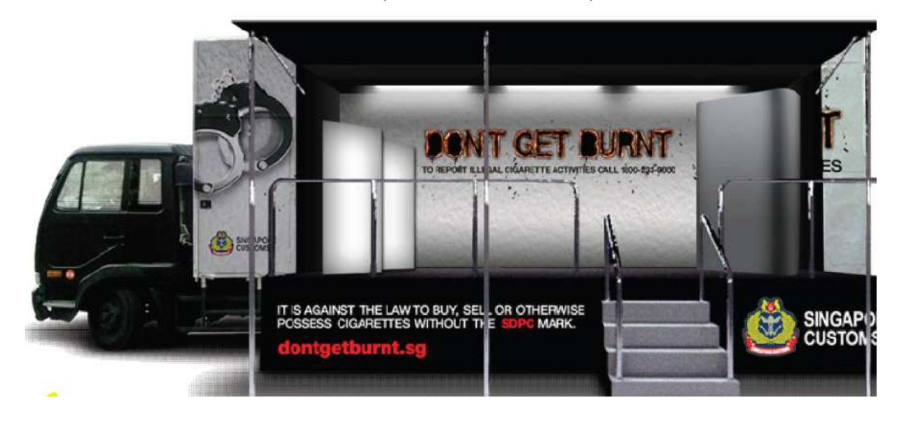
To this! (since 16 October 2010)

The inaugural roadshow for the public outreach campaign will debut on Saturday, 16 October 2010 at Woodlands Causeway Point, from 10.30 am to 3.30 pm. This is the first of a series of 25 public outreach roadshows that will span the entire campaign till July 2011 next year. The objective of the roadshows is to provide an interactive platform for Singapore Customs to engage the public, enabling them to understand the consequences and penalties of getting involved with illegal cigarettes. Through such engagement, Singapore Customs seeks public cooperation to stand firm against illegal cigarettes by reporting such activities to the authority,