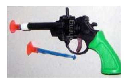
Shoot Out Illegal Cigarettes: Participants learn about the consequences of illegal cigarettes when they shoot at the target