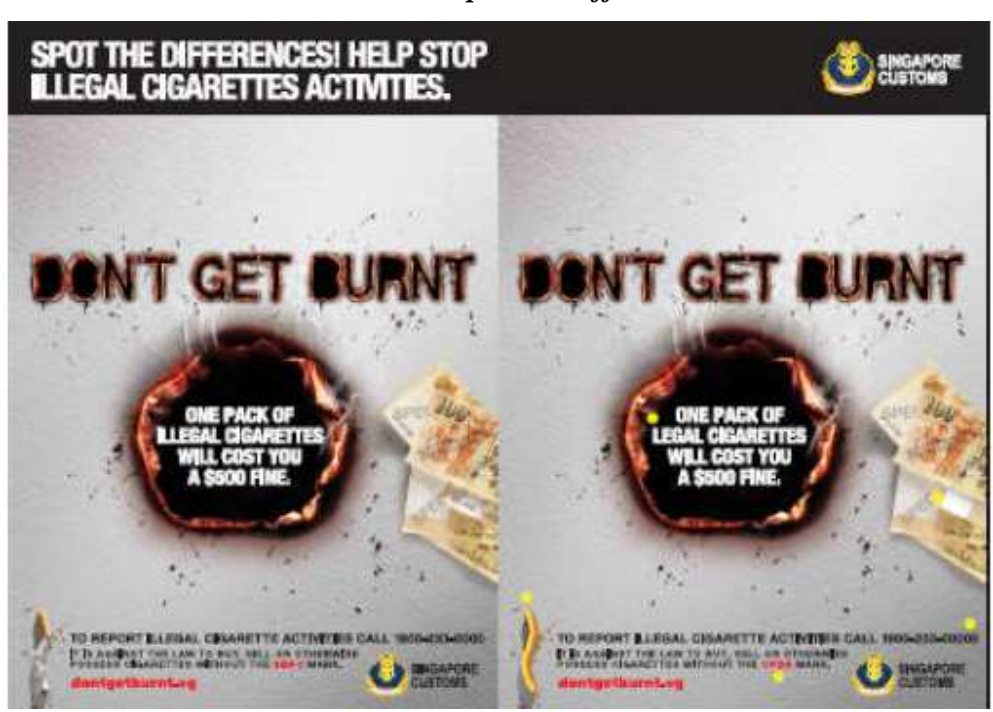
Classic Favourite: Spot the Difference Game