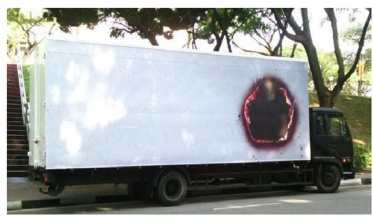
From this ... (since 27 August 2010)

The truth is finally out! From a roving truck with just an iconic burn mark, to a truck with antiillegal cigarette messages, to a mobile roadshow stage! Singapore Customs' unveils the truck in its full splendour for the launch of the first campaign roadshow. This marks the start of the series of public outreach roadshows as part of Singapore Customs' latest public outreach campaign against illegal cigarettes - "Don't Get Burnt".