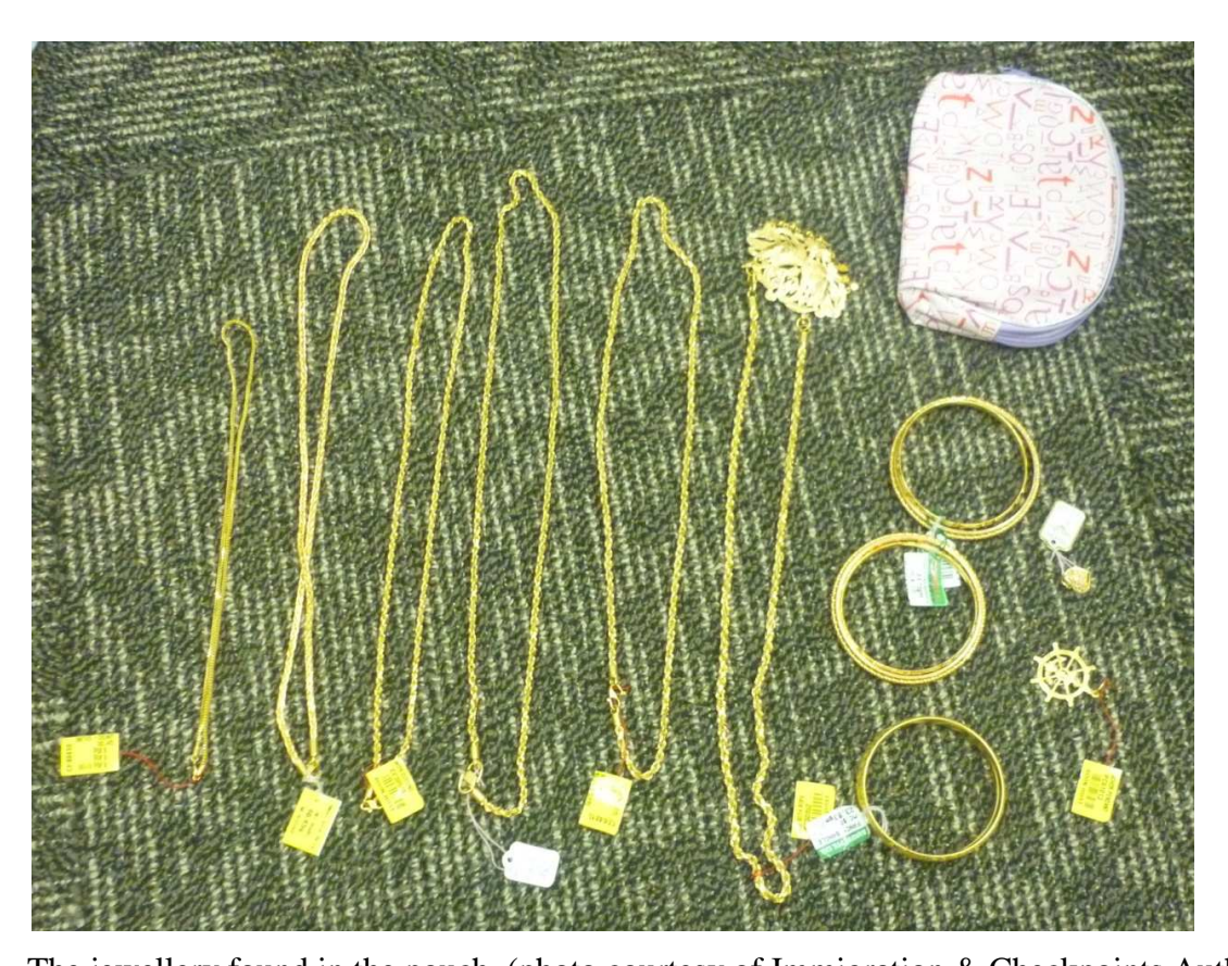
The jewellery found in the pouch.