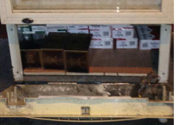
The compartment at the bottom of an abandoned refrigerator (above) was used to store contraband cigarettes.