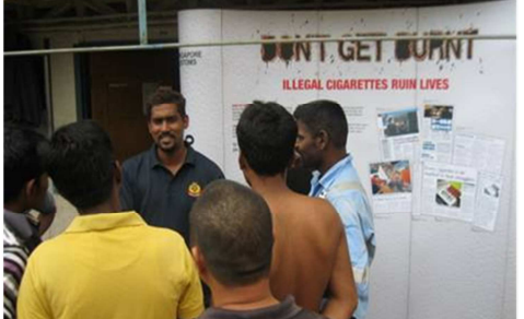
Singapore Customs officers conducting talks and road shows in schools and foreign worker dormitories.