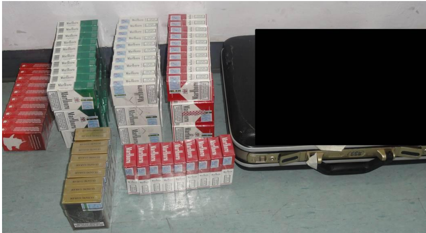
The six photos (above) show duty-unpaid cigarettes hidden in the bags of the seven Vietnamese men who left the apartment at intervals.