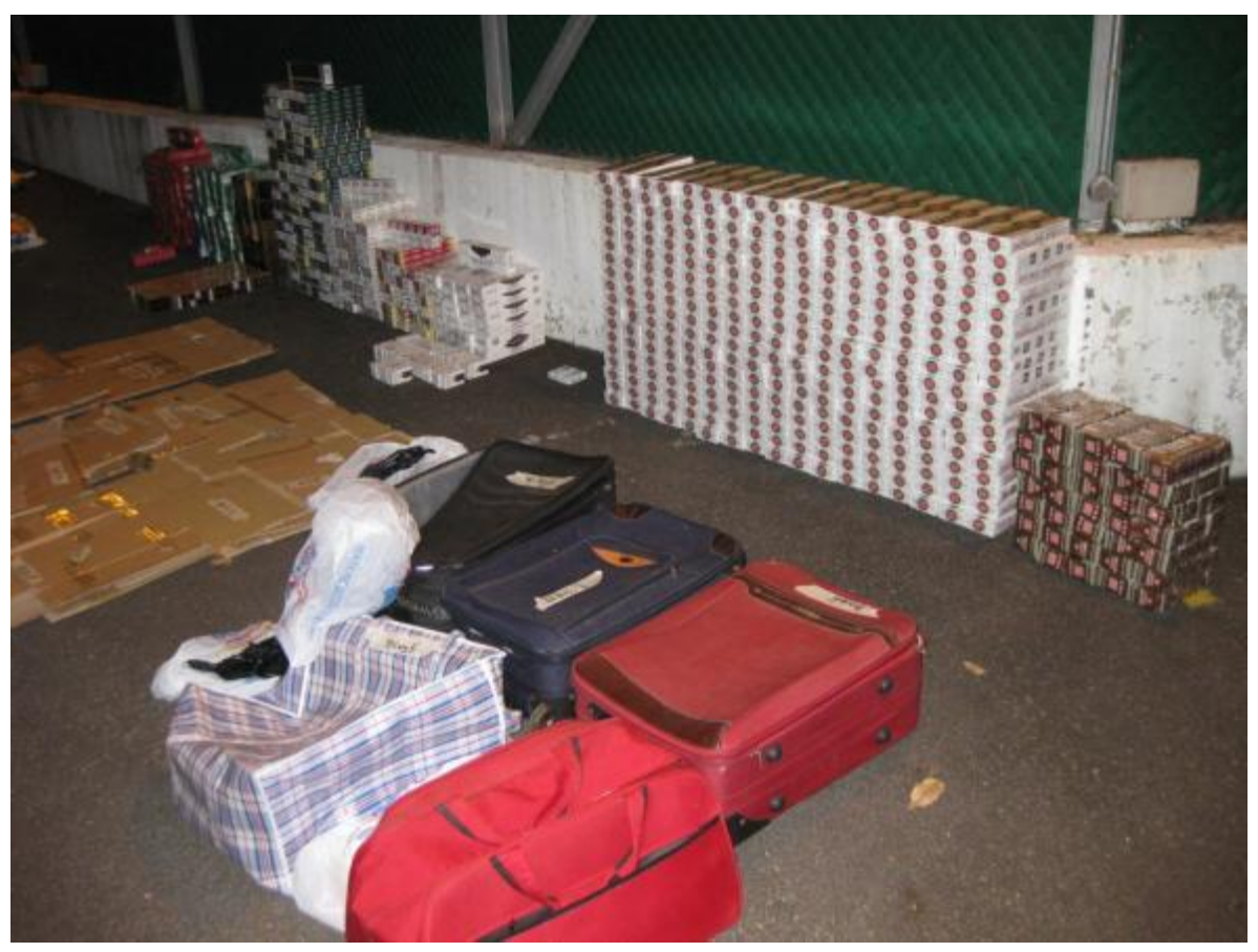
Contraband cigarettes, stored in luggage, recovered in one of the operations.