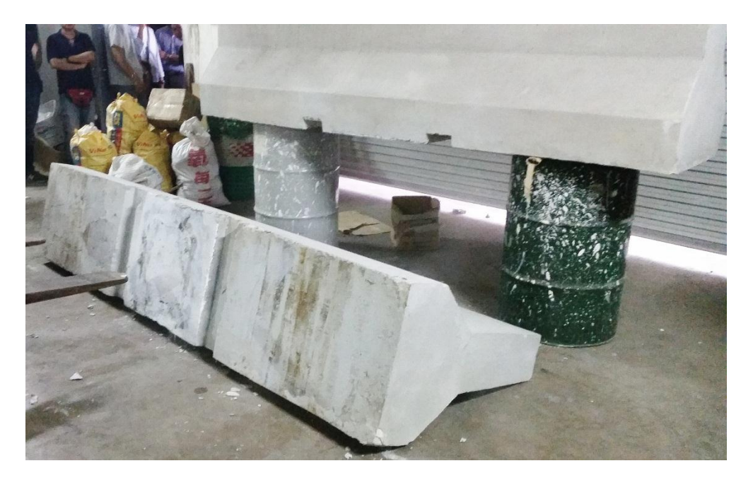
The duty-unpaid cigarettes were concealed in hollow spaces within the blocks of concrete barriers.