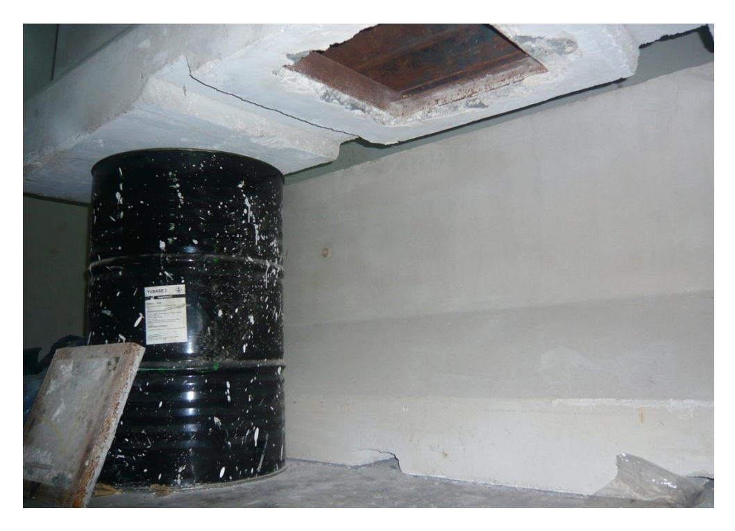
The concrete barriers had an opening beneath through which the duty-unpaid cigarettes could be retrieved.