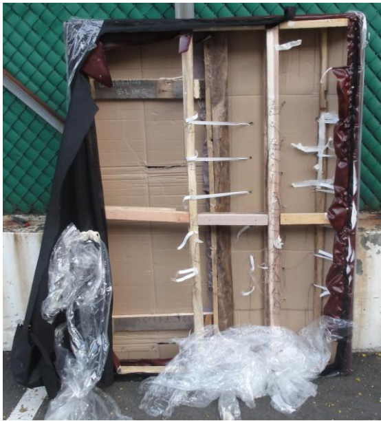
Duty-unpaid cigarettes were hidden in the hollow spaces within the modified bed headboards.