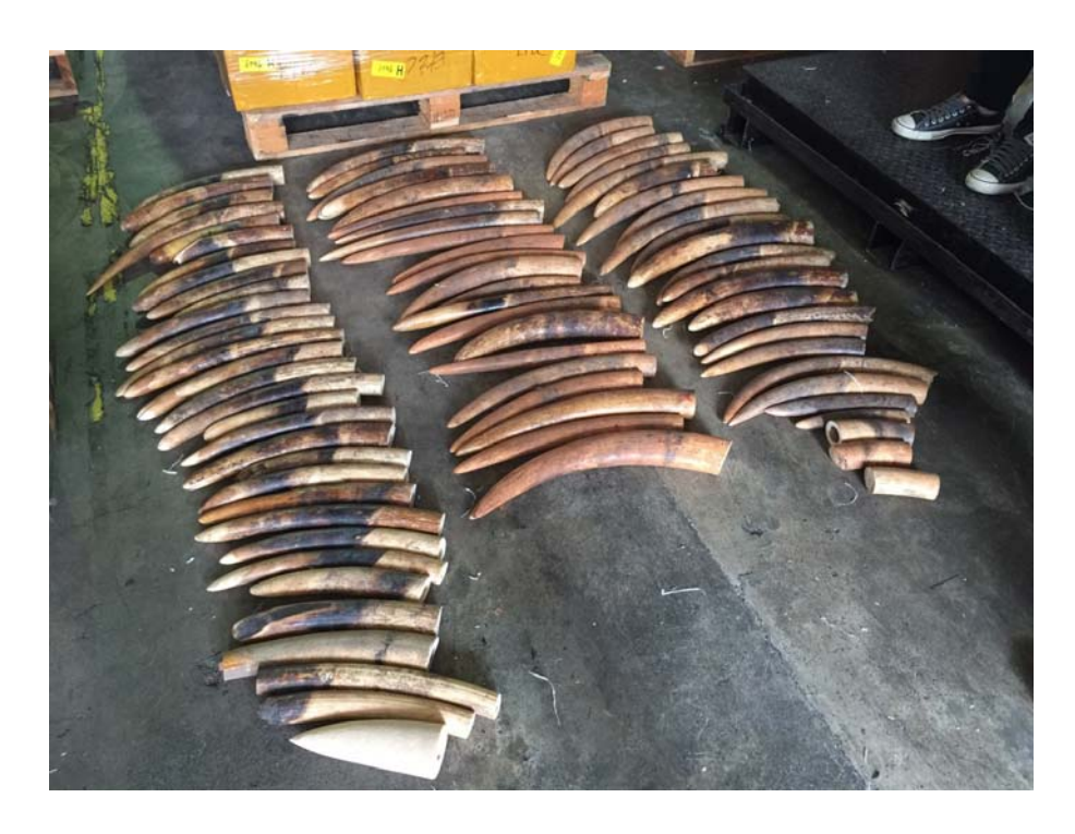
Illegal elephant tusks seized by AVA and Singapore Customs.