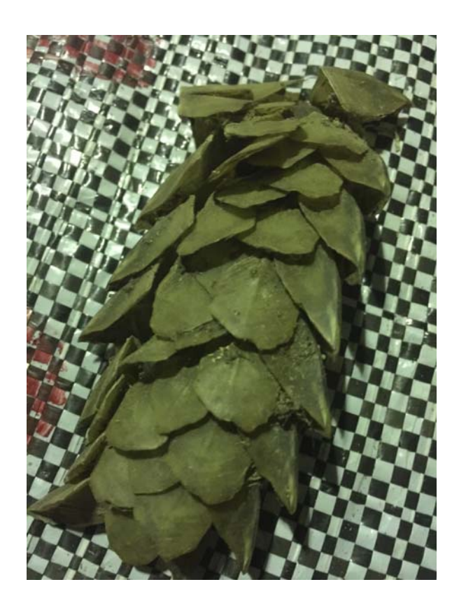
Illegal pangolin scales concealed in the shipment declared as "wigs".