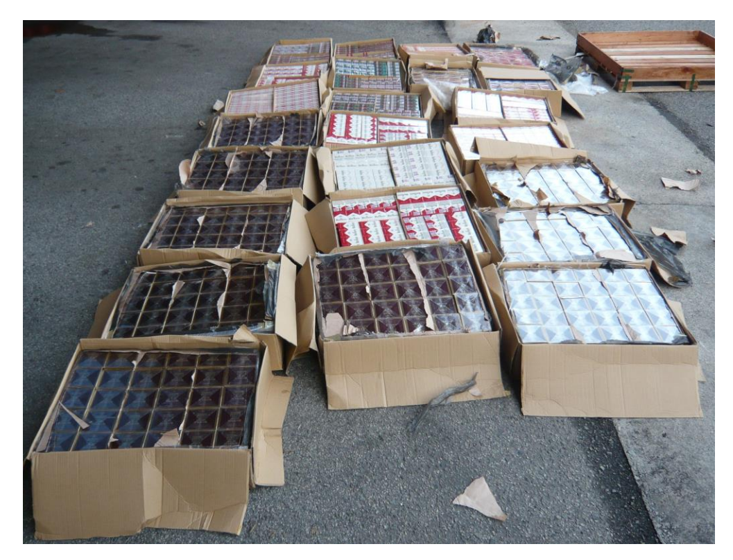
Singapore Customs seized 14,400 cartons of duty-unpaid cigarettes in a warehouse at Kallang Avenue on 20 May 2013.