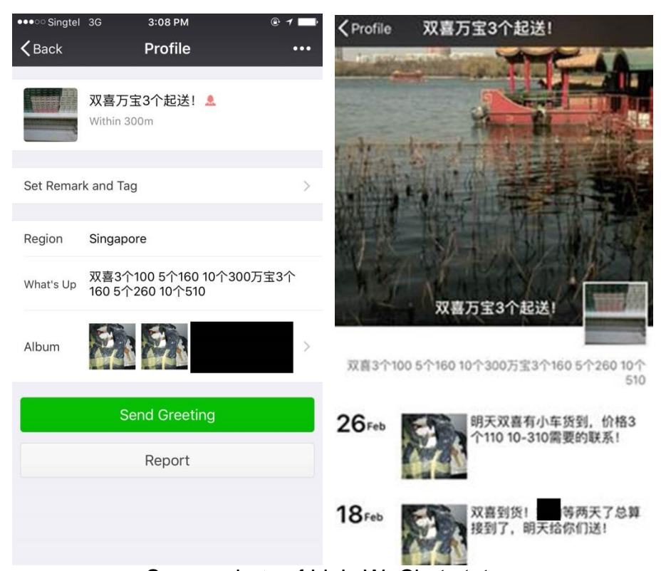
Screen shots of Liu's WeChat status.