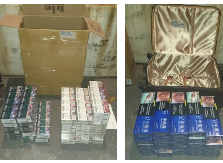
Some of the contraband cigarettes seized from Ma and Zhang's rented room in an HDB flat in Woodlands Ring Road.