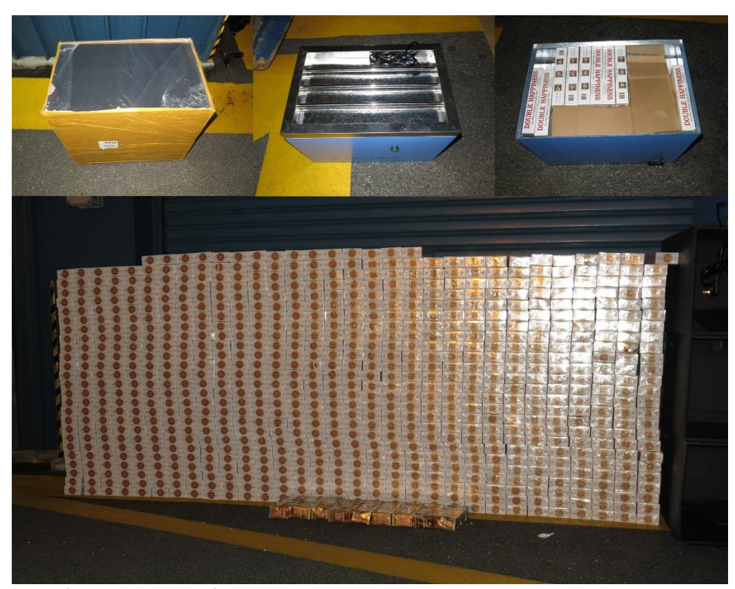
A total of 799 cartons of duty-unpaid cigarettes, hidden within a consignment of soldering devices, were seized in the case involving the 28-year-old male Chinese national.