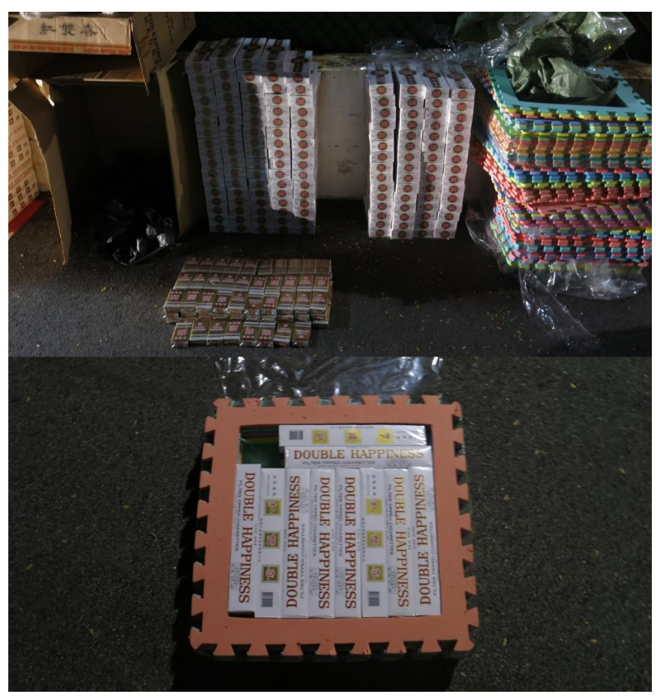
More than 1,873 cartons of duty-unpaid cigarettes were seized in the case involving Chen and Zheng.