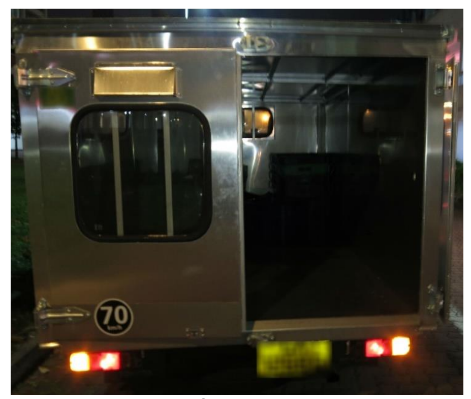
The van belonging to Chen's employer, used to deliver duty-unpaid cigarettes, was also seized.