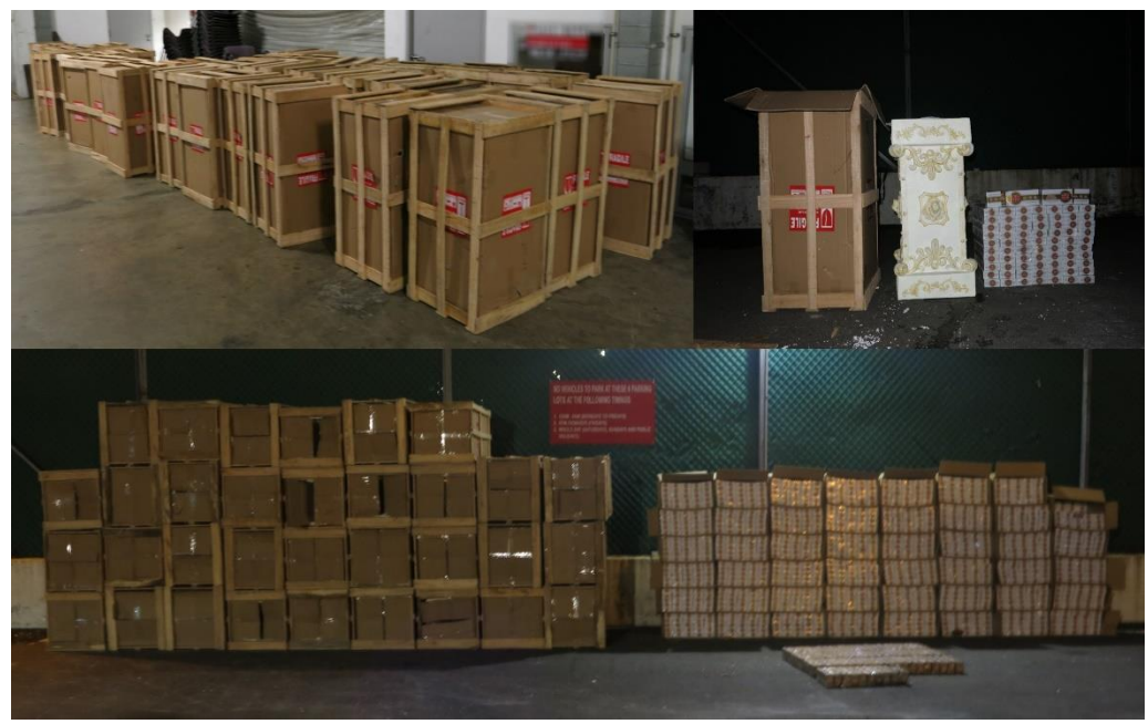
A total of 2,409 cartons of duty-unpaid cigarettes, hidden in display stands, were seized in the case involving the 36-year-old male Chinese national.