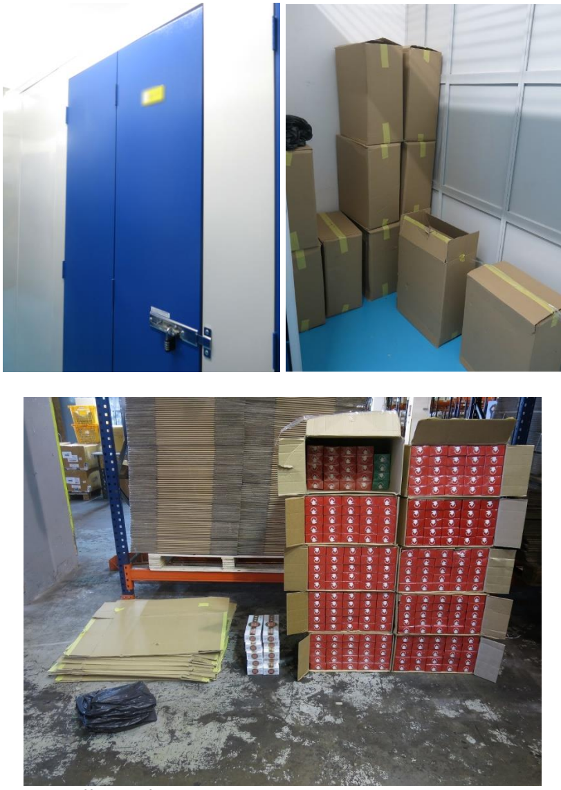
Singapore Customs officers followed up with another operation on the same day and seized another 484 cartons of duty-unpaid cigarettes from a unit of a self-storage facility in Woodlands Close.