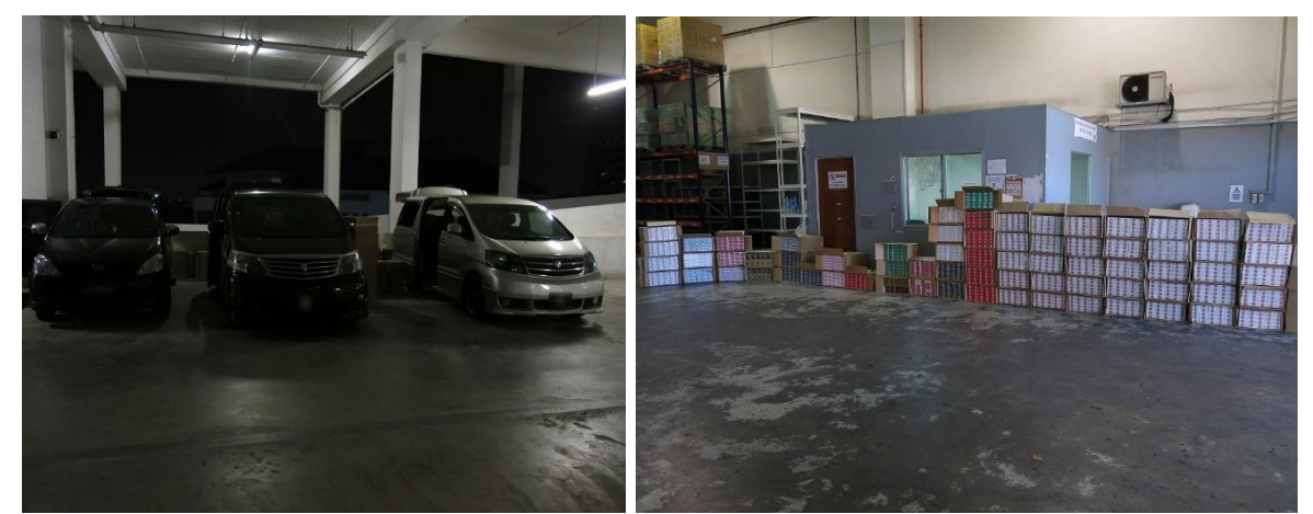
Three vehicles and 3,450 cartons of duty-unpaid cigarettes were seized in the car park of the commercial building in Toh Guan Road.