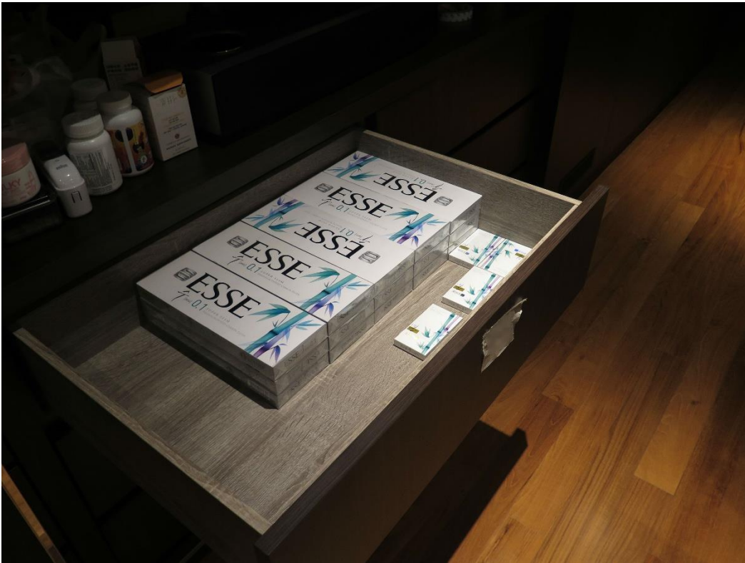
Singapore Customs officers searched Yin's residential unit in Marina Boulevard and recovered another 15 cartons, three packets and 16 sticks of duty-unpaid cigarettes.