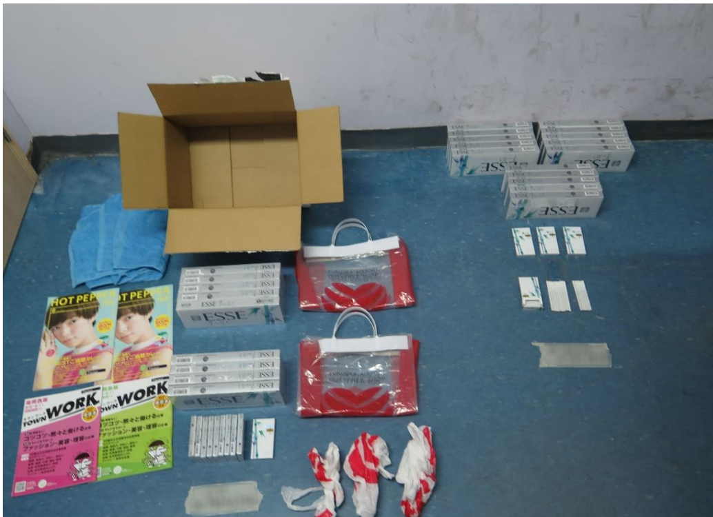
A total of 24 cartons, 13 packets and 16 sticks of duty-unpaid cigarettes were seized in this operation.