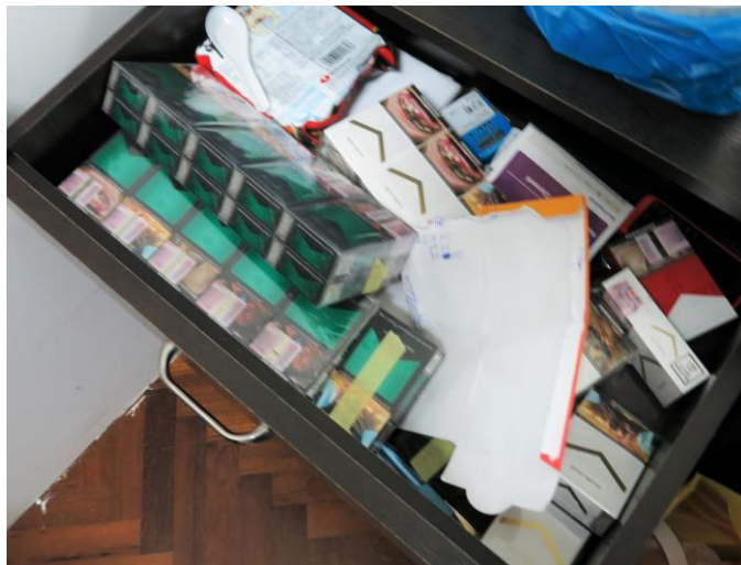
A total of 260 cartons and 421 packets of duty-unpaid cigarettes were seized from Xu's room.