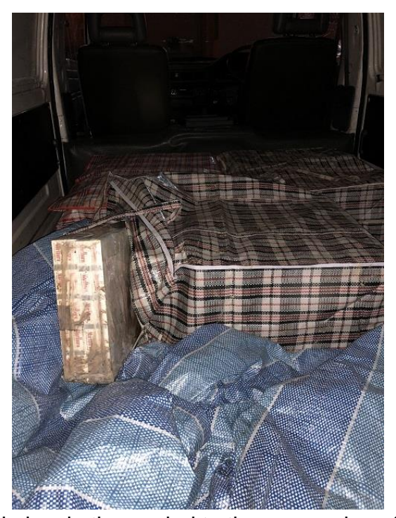
The discovery of a vehicle key in the car led to the uncovering of another 200 cartons of duty-unpaid cigarettes in a white van parked in Lorong 20 Geylang.