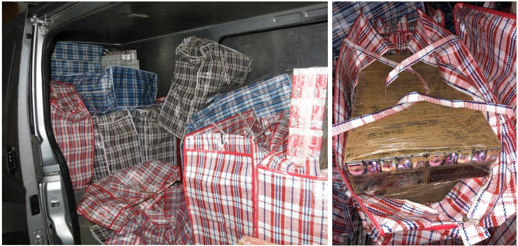
A total of 1,375 cartons of duty-unpaid cigarettes were seized from the silver van parked in a multi-storey car park in East Coast Road.