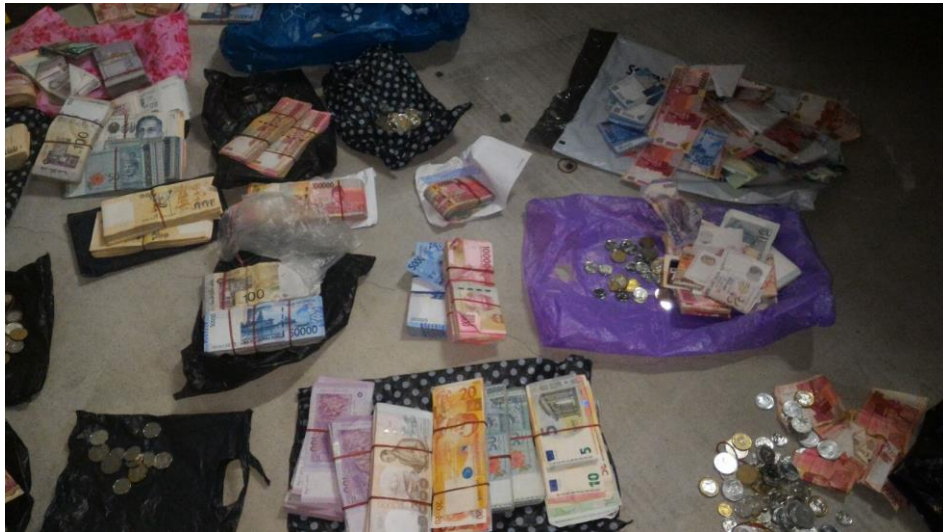
Singapore Customs officers conducted a follow-up search of Iskandar’s car and found local and foreign currencies of over S$120,000.