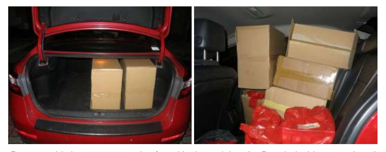
Duty-unpaid cigarettes were also found in the taxi that the Bangladeshi men took to the HDB block in Woodlands Circle.