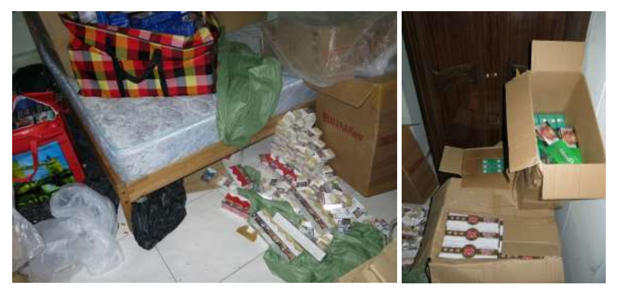
More duty-unpaid cigarettes were uncovered in the follow-up search of a flat in the same HDB block in Tampines Street 34.