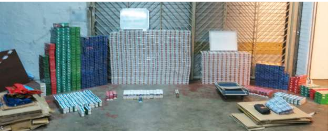
A total of 1,389 cartons and 1,416 packets of duty-unpaid cigarettes were seized from the two operations.