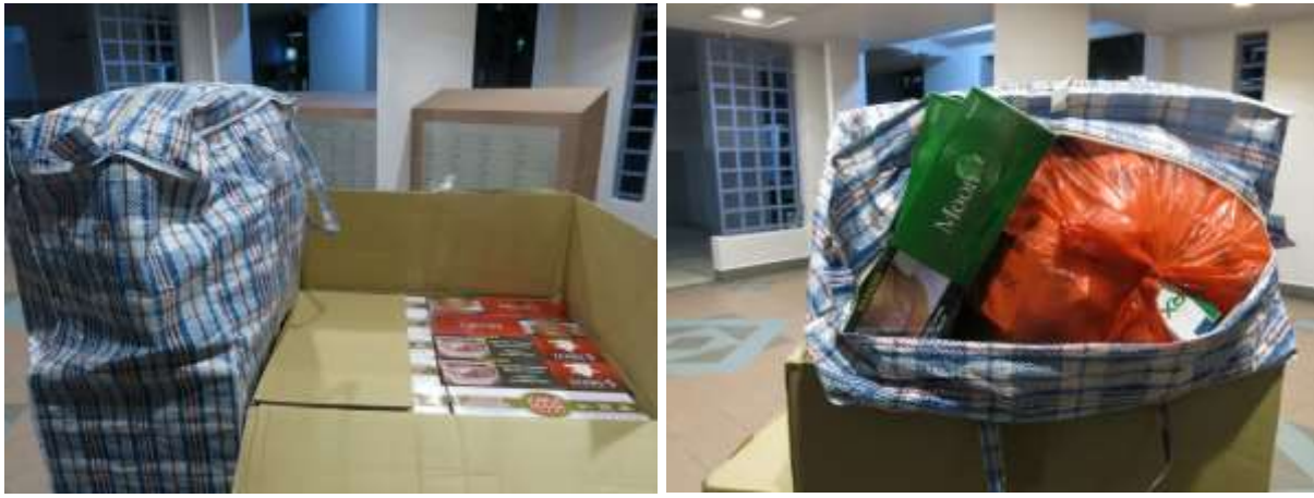
Singapore Customs officers stopped two Chinese nationals who were pushing a trolley of brown boxes and a canvas bag, suspected to contain duty-unpaid cigarettes, at the void deck of the HDB block in Tampines Street 34.