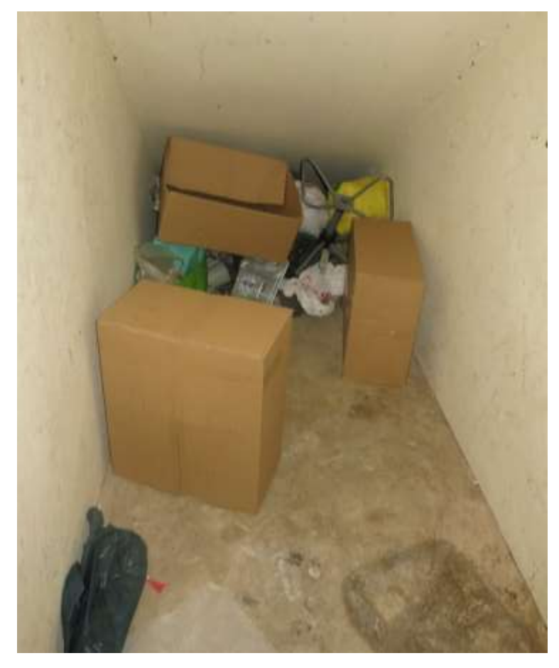
Brown boxes containing duty-unpaid cigarettes were found in the storeroom at the void deck of a HDB block in Woodlands Circle.