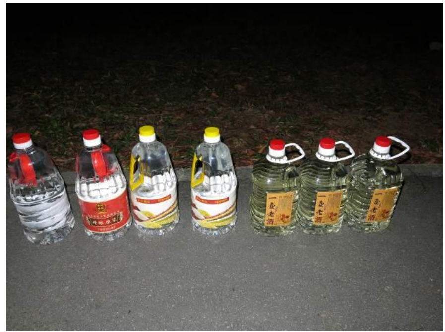
Seven bottles of duty-unpaid liquor were found on the passenger seat of the cement truck that Guo was driving.