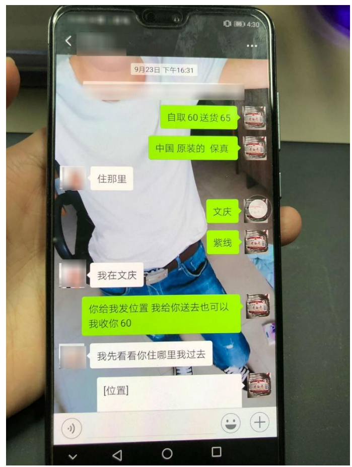
A WeChat conversation between Zhu and a buyer.