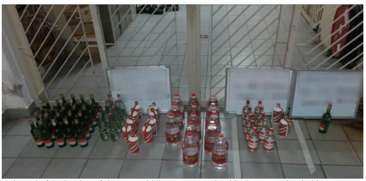
A total of 67 bottles of duty-unpaid liquor were seized in the operation in Hougang Avenue 3 on 23 October 2018 night.