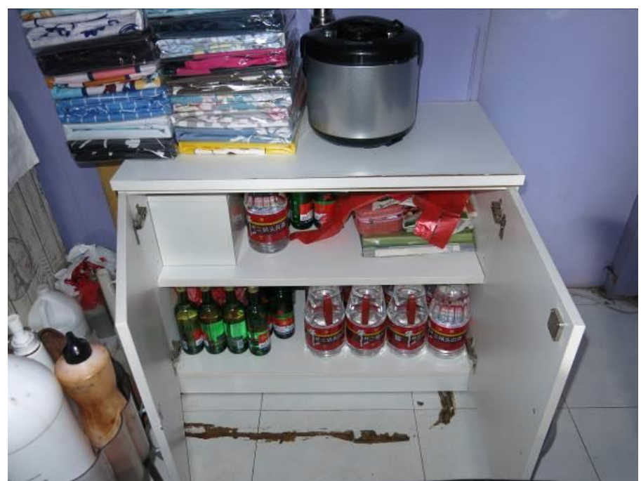
Singapore Customs officers found six bottles of duty-unpaid liquor in the haversack and plastic bag of a man during an operation on 19 October 2018. A follow-up search of a hair salon in Geylang Road uncovered another 45 bottles of duty-unpaid liquor stored in a cupboard.