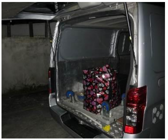
On 7 November 2018, Singapore Customs officers conducted an operation in an industrial unit in Tuas South Street 1. Five Malaysian men were arrested. A total of 5,431 cartons and 29 packets of duty-unpaid cigarettes and a van were seized.