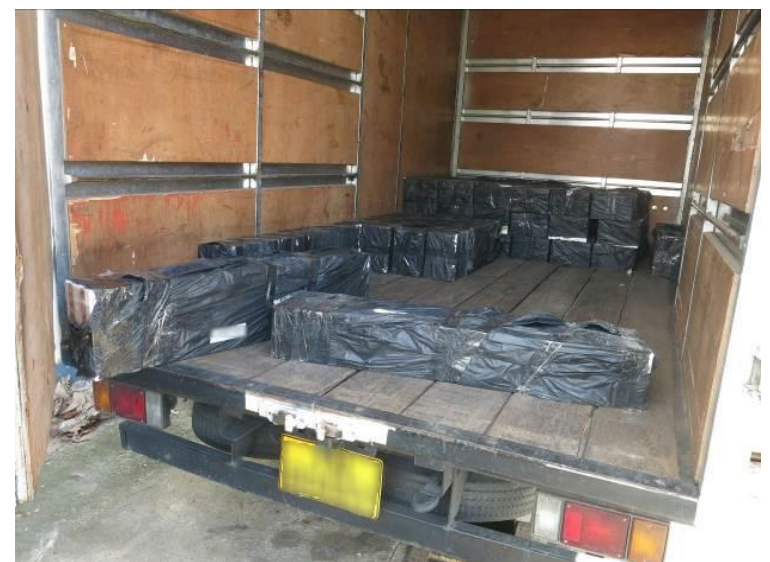
Singapore Customs officers raided a yard in Tuas Avenue 14 on 24 November 2018 and arrested four men who were retrieving duty-unpaid cigarettes that were hidden in concrete slabs and loading them onto a lorry.