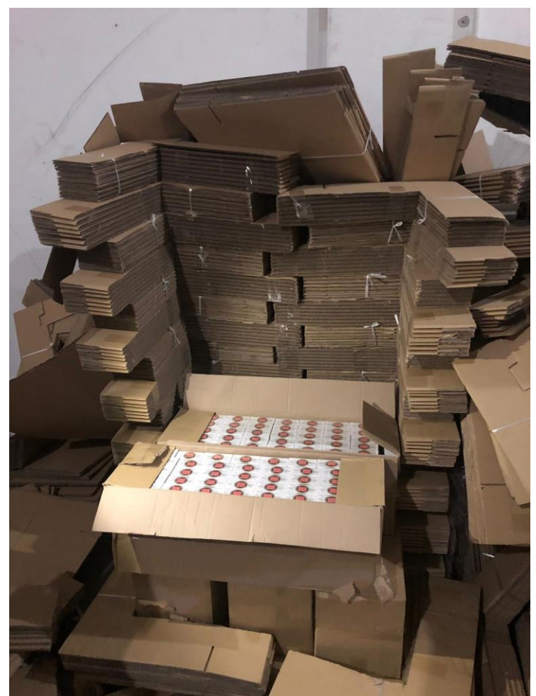
Duty-unpaid cigarettes found in the warehouse unit in Bukit Batok Crescent