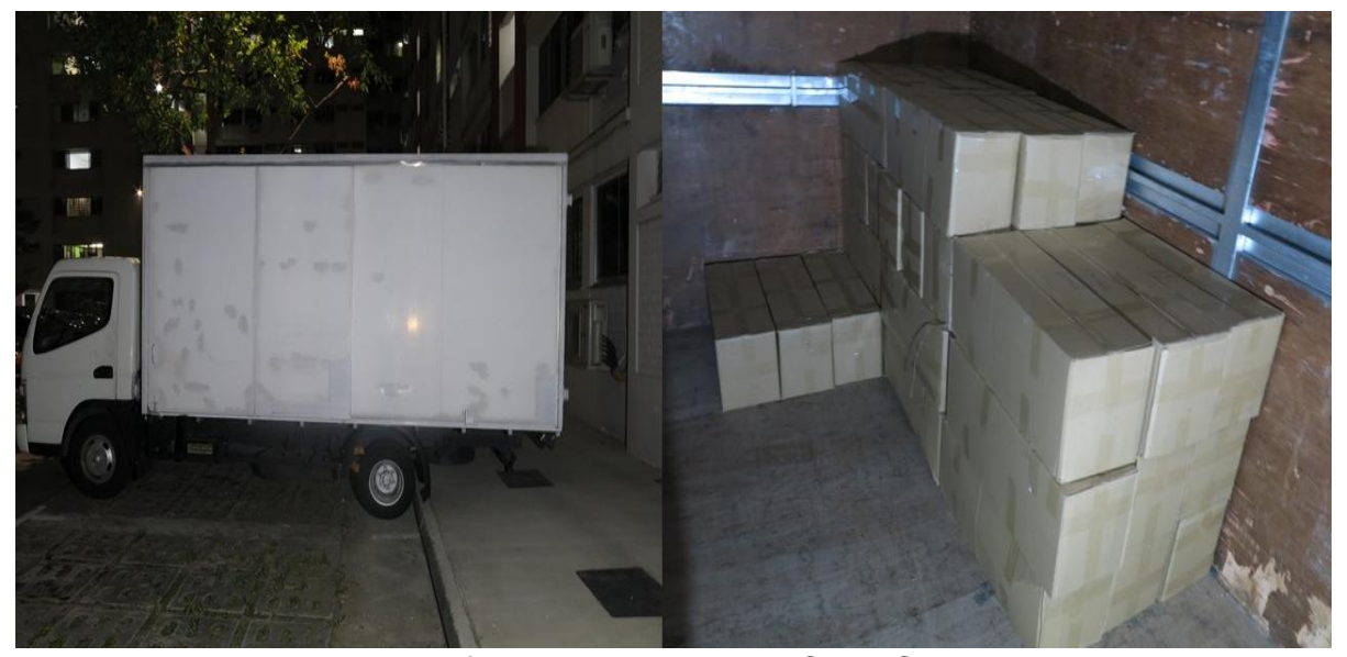
Duty-unpaid cigarettes found in the trucks in Choa Chu Kang Ave 2 and 3