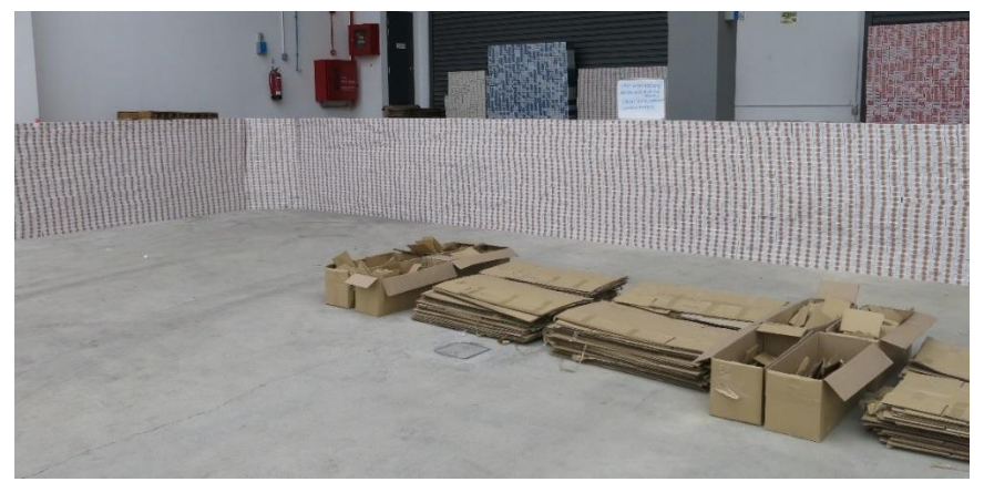
Duty-unpaid cigarettes seized on 18 September 2019