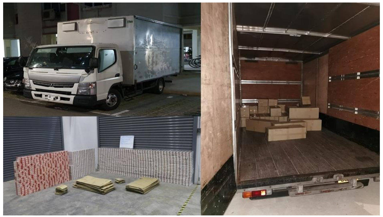
Duty-unpaid cigarettes uncovered in the truck in Woodlands Street 13