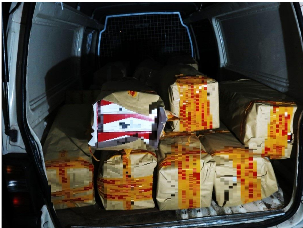
Duty-unpaid cigarettes found in van

9. CNB and Singapore Customs will continue to clamp down on illegal activities and those found engaging in such activities will be dealt with in accordance with the law.