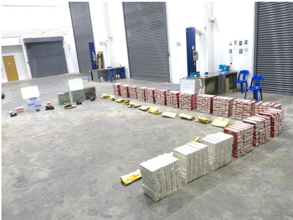
More than 1,112 cartons of duty-unpaid cigarettes seized

CENTRAL NARCOTICS BUREAU SINGAPORE CUSTOMS 3 Jun 2020